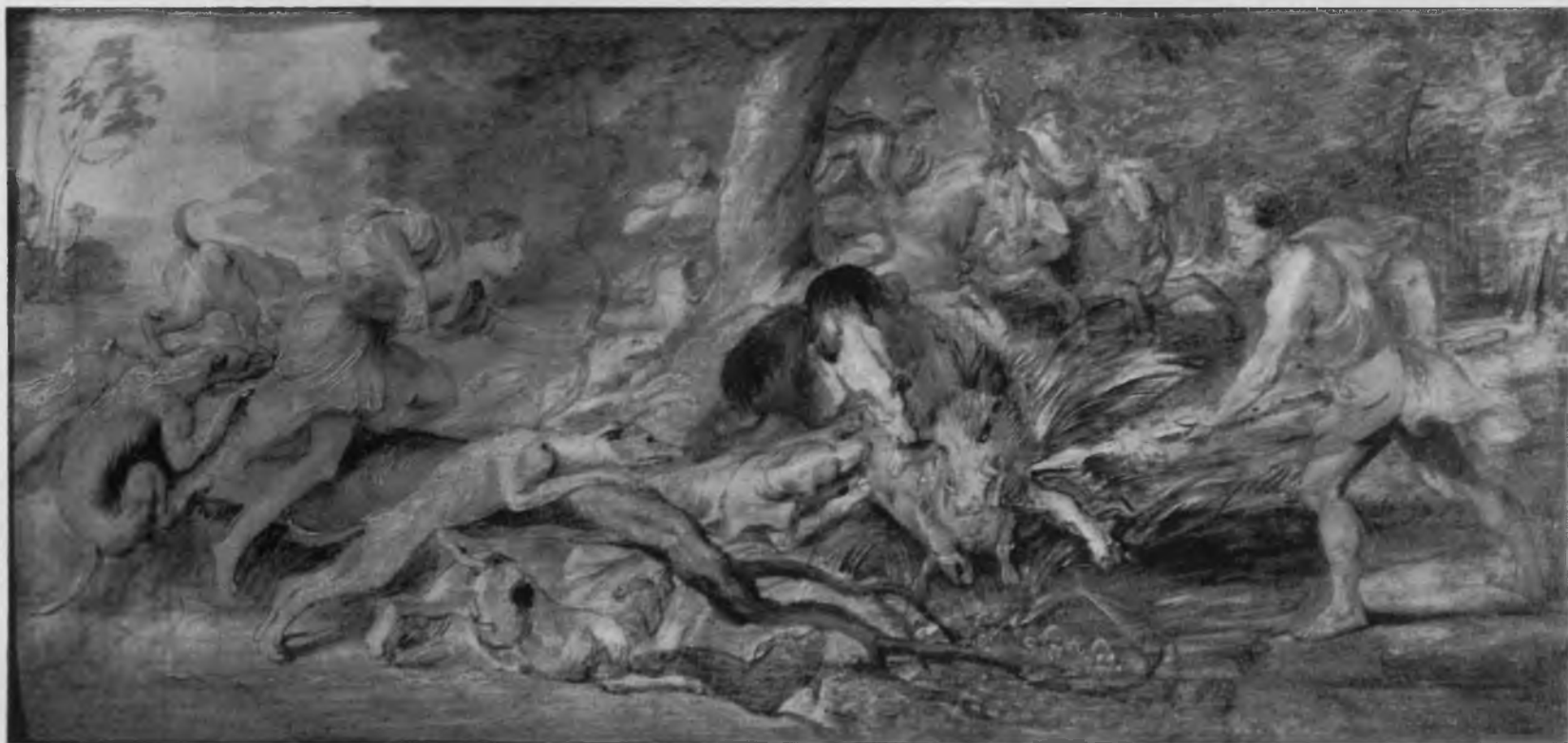
105. Rubens, The Calydonian Boar Hunt , oil sketch (No.20a). Jersey, Coll. Sir Francis Cook