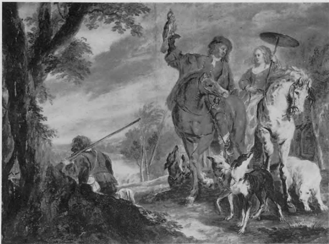
91. ?A. van Diepenbeek, Hawking Party , oil sketch. Present whereabouts unknown