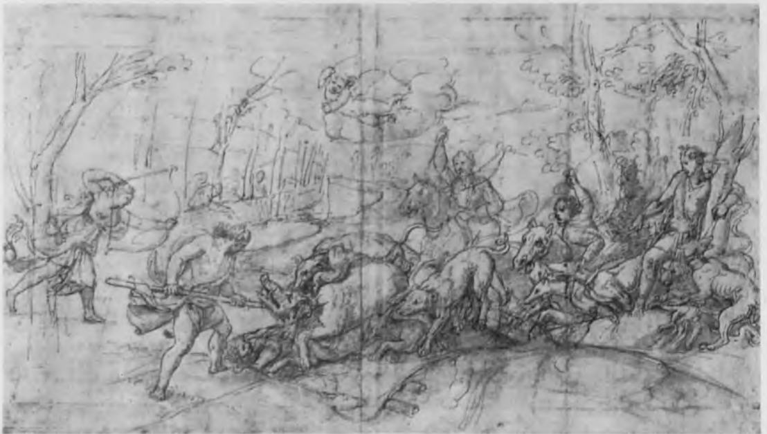
28. Giulio Romano, The Calydonian Boar Hunt , drawing. London, British Museum