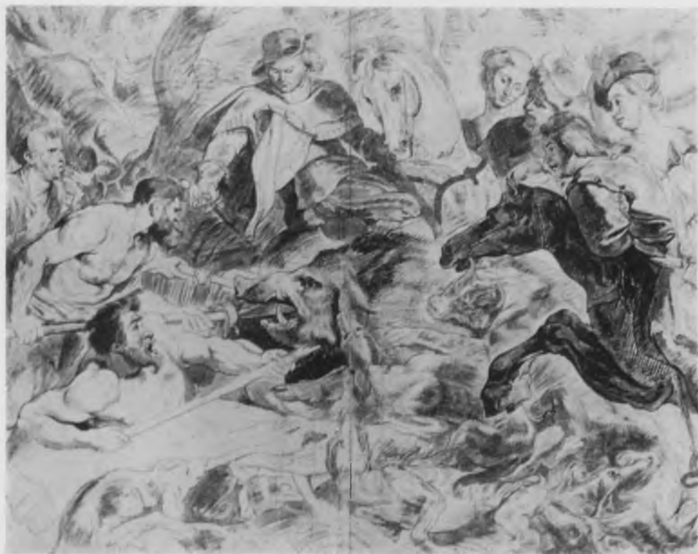
42. P. Soutman, Boar Hunt , drawing (No.4, copy 11). Present whereabouts unknown