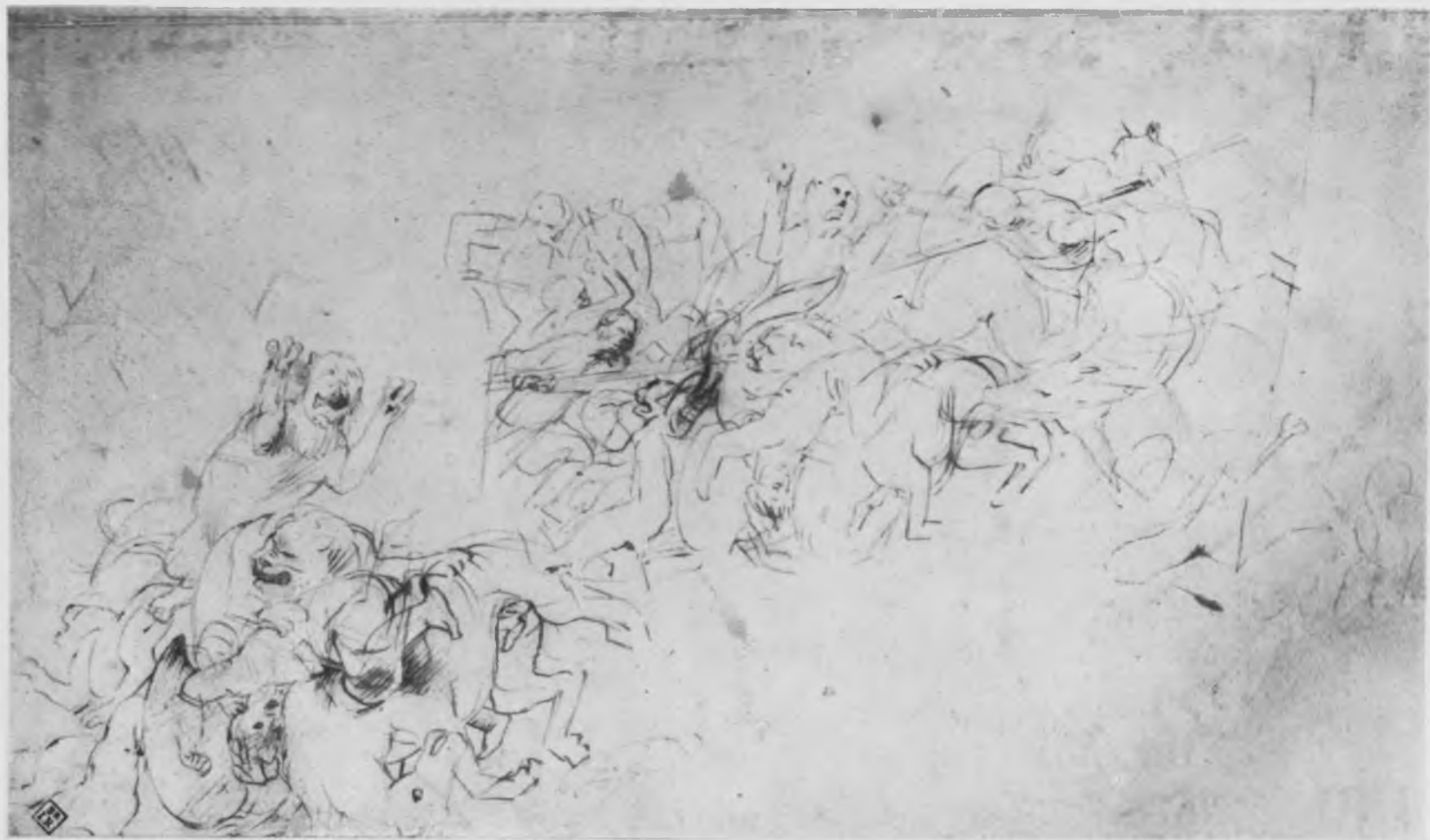
52. Detail of Fig. 53