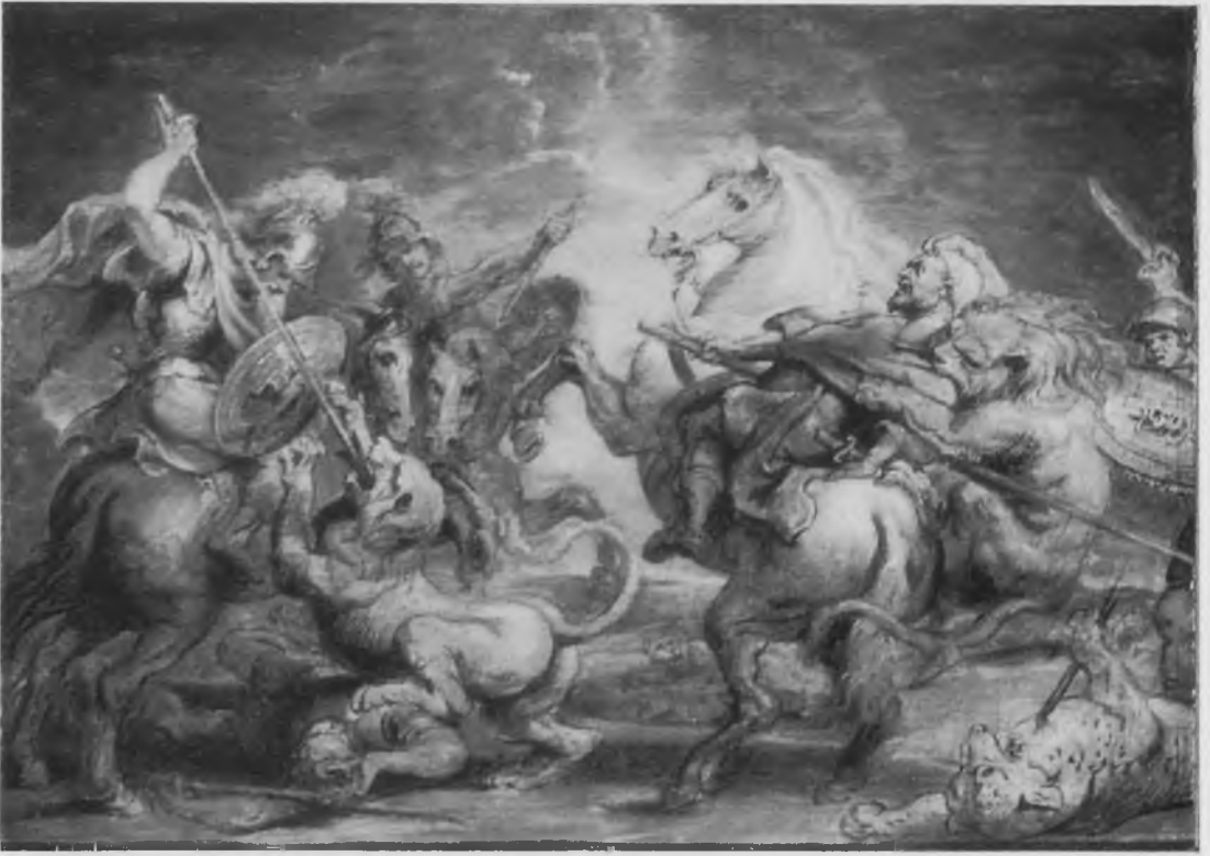
95. ?Rubens or ?E.Quellin, Alexander's Lion Hunt , oil sketch (No.16a). Oslo, Nasjonalgalleriet