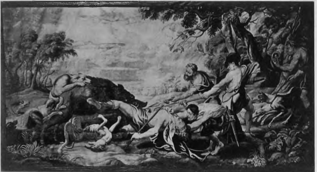
121. D. Eggermans (?the Younger), The Death of Adonis , tapestry (No.24, copy 9). Present whereabouts unknown