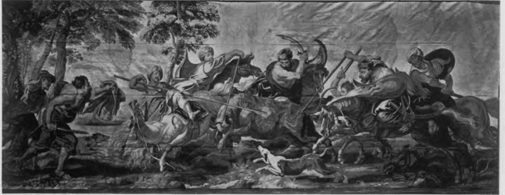
127. D. Eggermans (?the Younger), Bull Hunt , tapestry (No.26, copy 18). Present whereabouts unknown