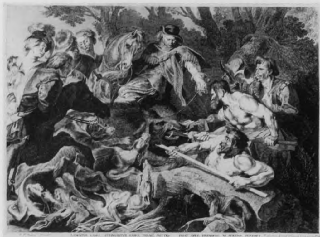
43. P. Soutman, Boar Hunt , etching (No.4, copy 13)