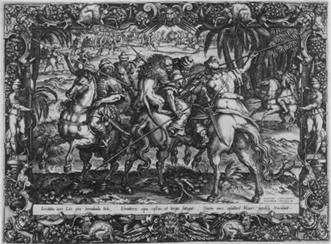
20. H.Muller after Stradanus, Lion Hunt , engraving