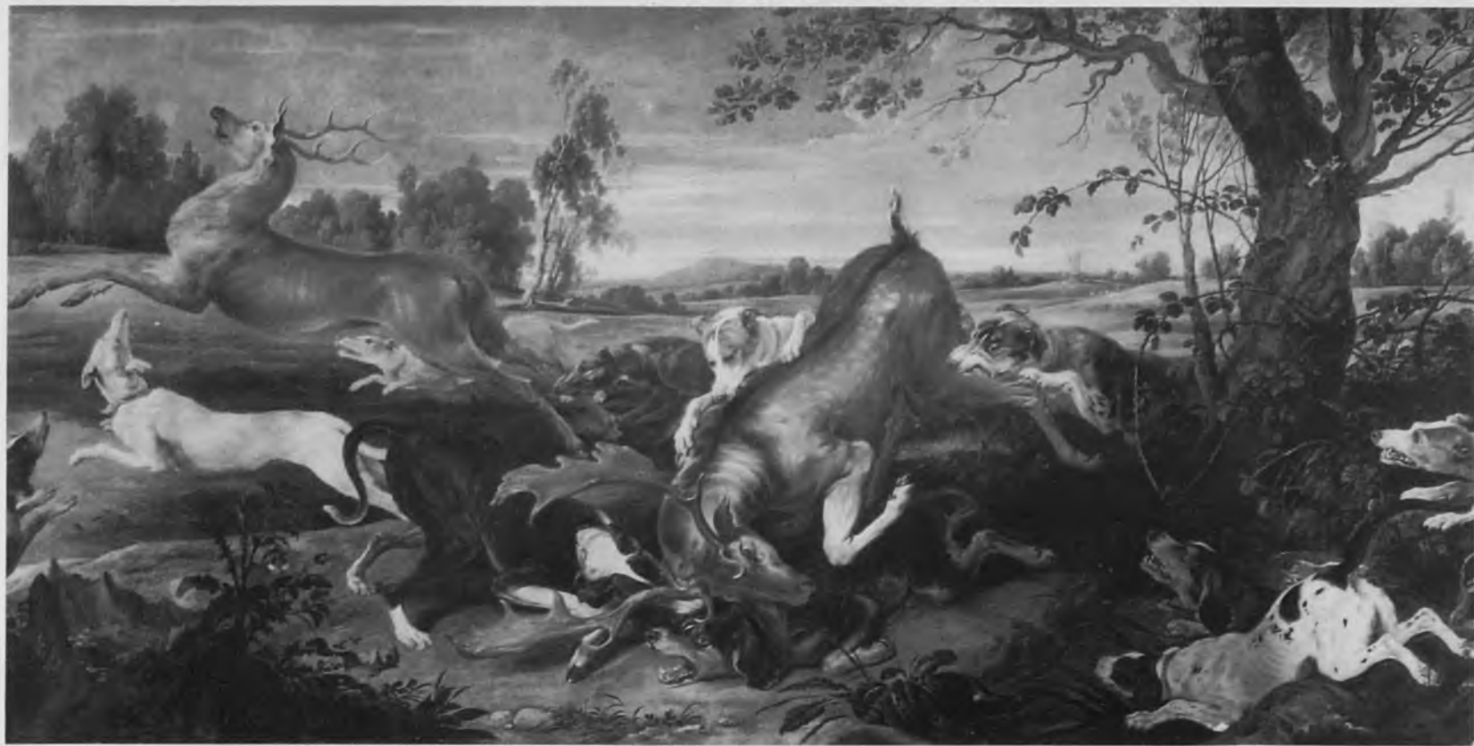
9. F. Snyders, Deer Hunt . Brussels, Musées Royaux des Beaux-Arts