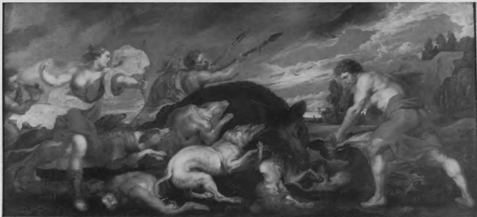
81. Studio of Rubens, The Calydonian Boar Hunt (No.12, copy 1). Easton Neston, Towcester, Northants, Coll. Lord Hesketh