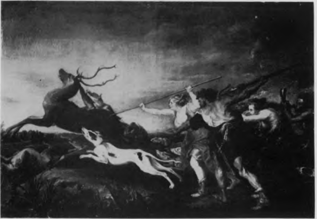
102. Studio of Rubens, and F. Snyders(?), Diana with Attendants hunting Deer (No.19, copy 1). Formerly Potsdam-Sanssouci, Neues Palais, now lost