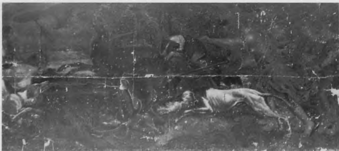
83. ?Rubens, Diana and Nymphs hunting Deer (No.13, copy 1), during restoration. Present whereabouts unknown