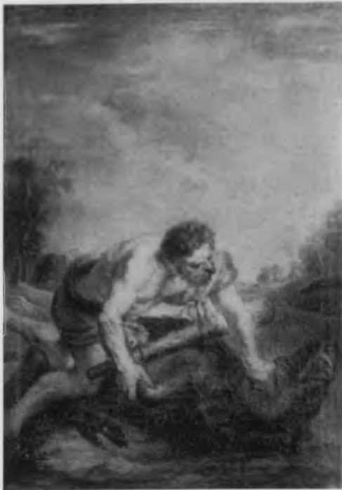
143. J.B.del Mazo after Rubens, Hercules and the Erymanthian Boar. Dijon, Musée Magnin