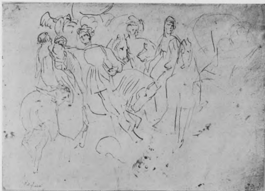
90. Rubens, Hawking Party , drawing (No. 14a). Present whereabouts unknown