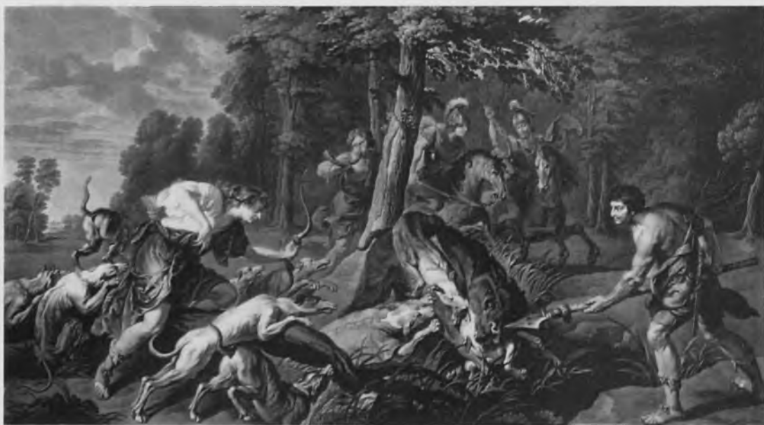
106. R.Earlom, The Calydonian Boar Hunt , mezzotint (No.20, copy 11)