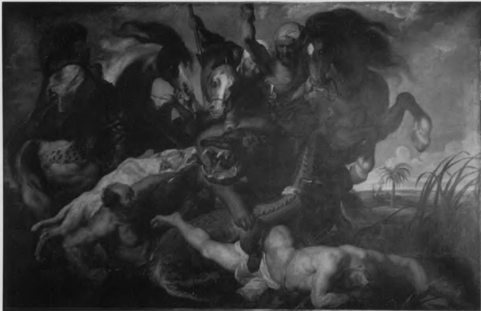
47. Studio of Rubens, Hippopotamus and Crocodile Hunt (No.5, copy 1). Formerly Utrecht, Rijksuniversiteit, now lost