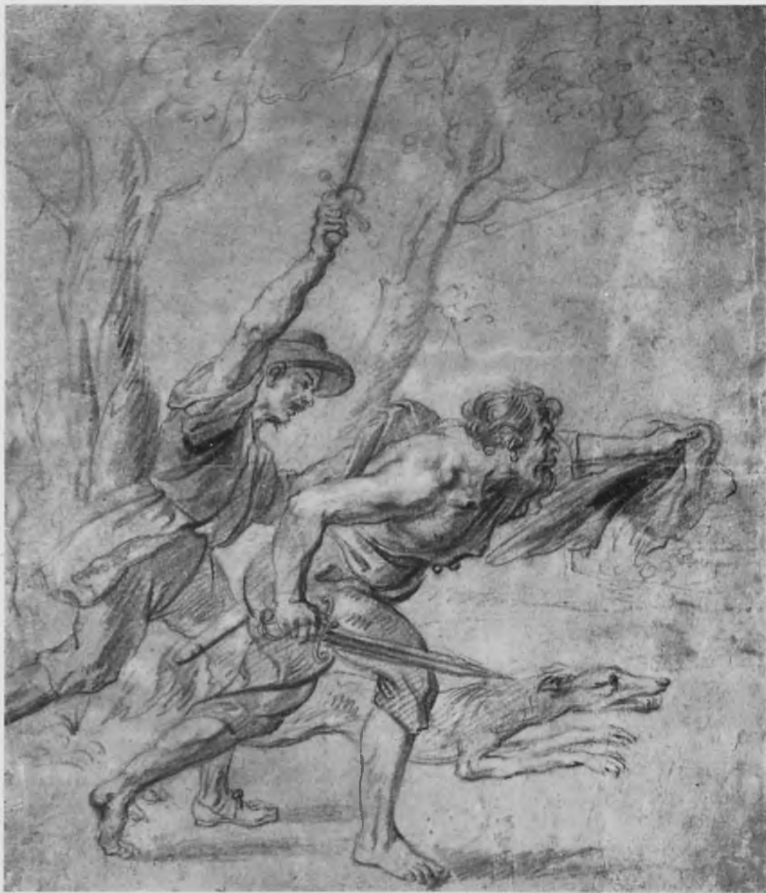
128. After Rubens, Bull Hunt , drawing (No.26, copy 12). Paris, Fondation Custodia, Institut Néerlandais