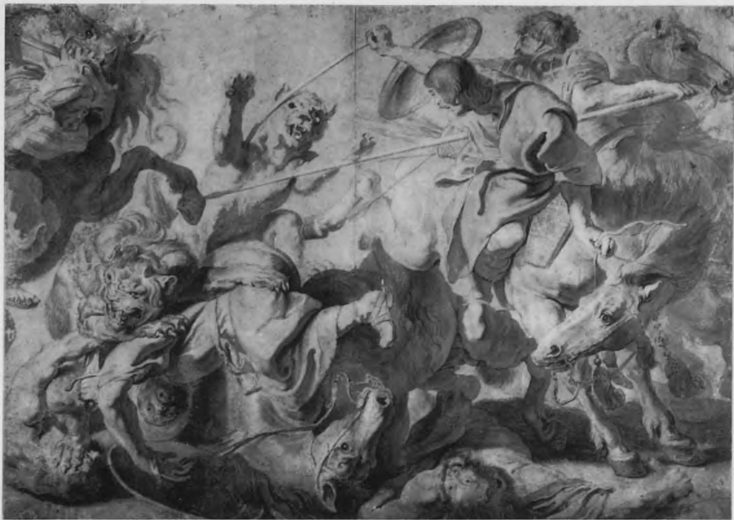
55. ?P. Soutman, Lion Hunt , drawing (No.6, copy 6). Present whereabouts unknown