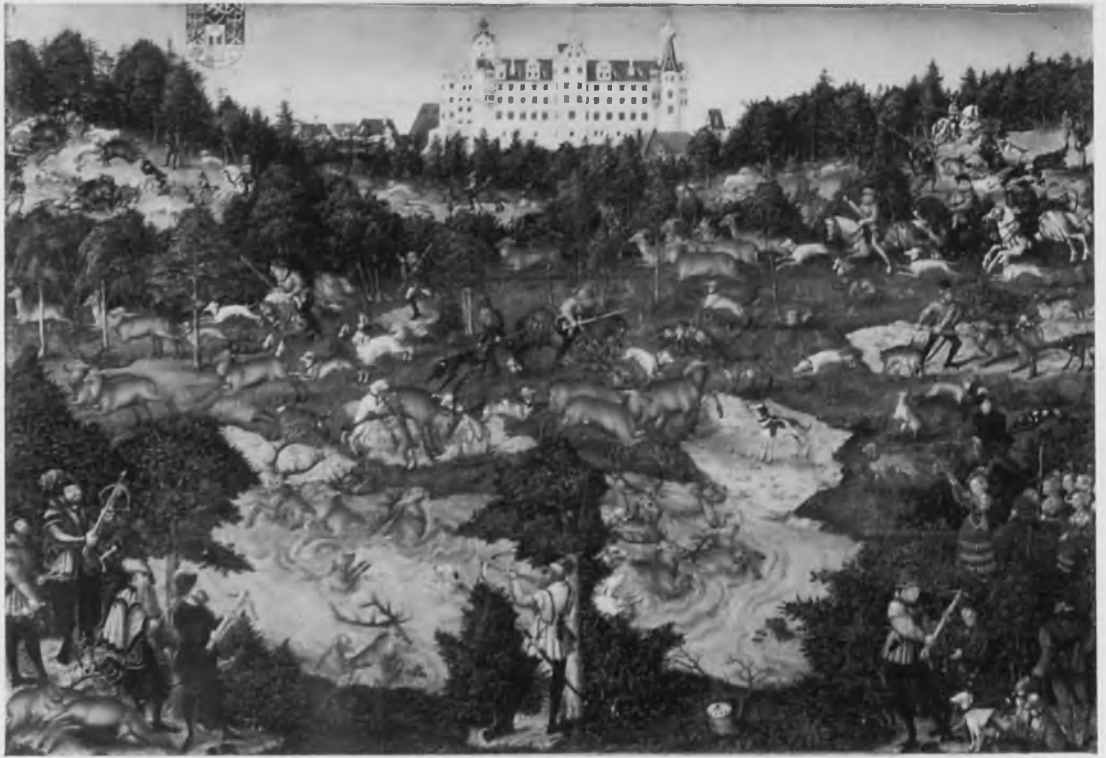
11. L. Cranach, The Deer Hunt of Charles V and the Elector Johann Friedrich of Saxony . Madrid, Prado