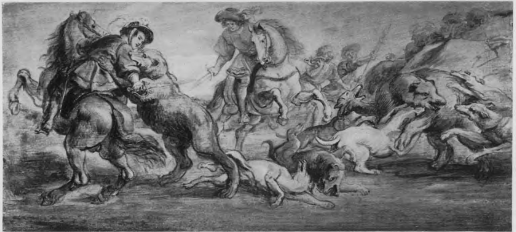
133. Rubens, Bear Hunt , oil sketch (No.27a). Cleveland, Ohio, The Cleveland Museum of Art