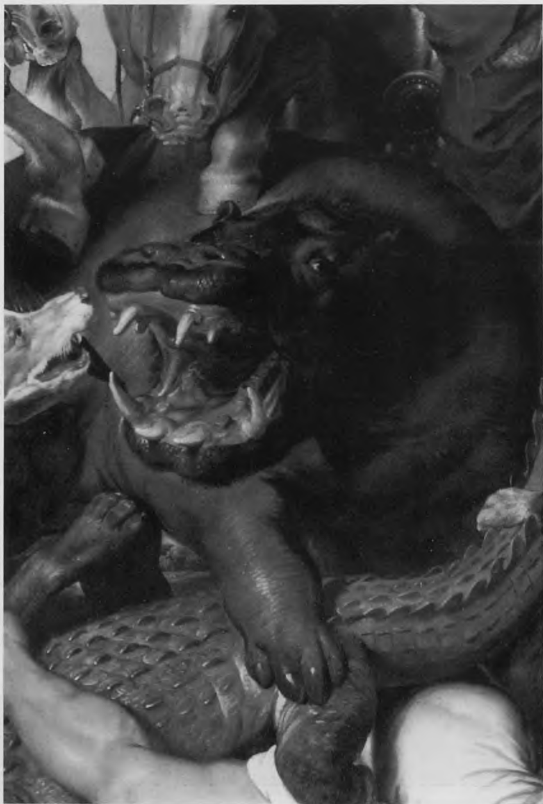
48. Detail of Fig.46