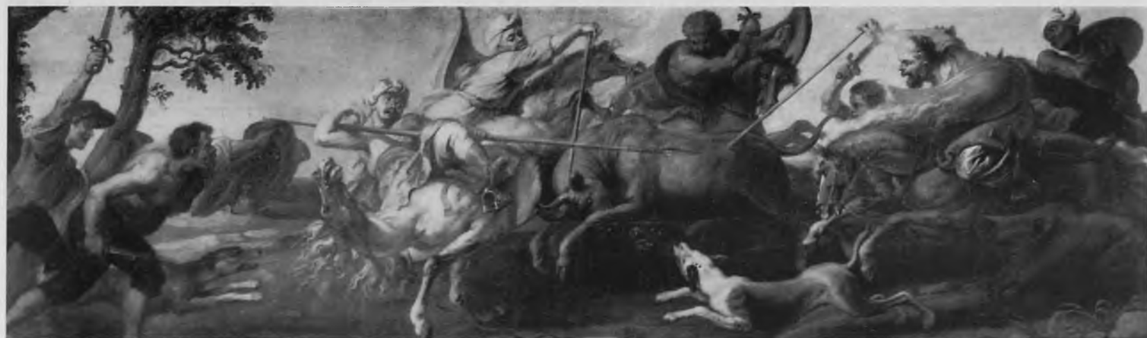
126. Rubens and F.Snyders, Bull Hunt (No.26). Gerona, Museo Arqueológico Provincial