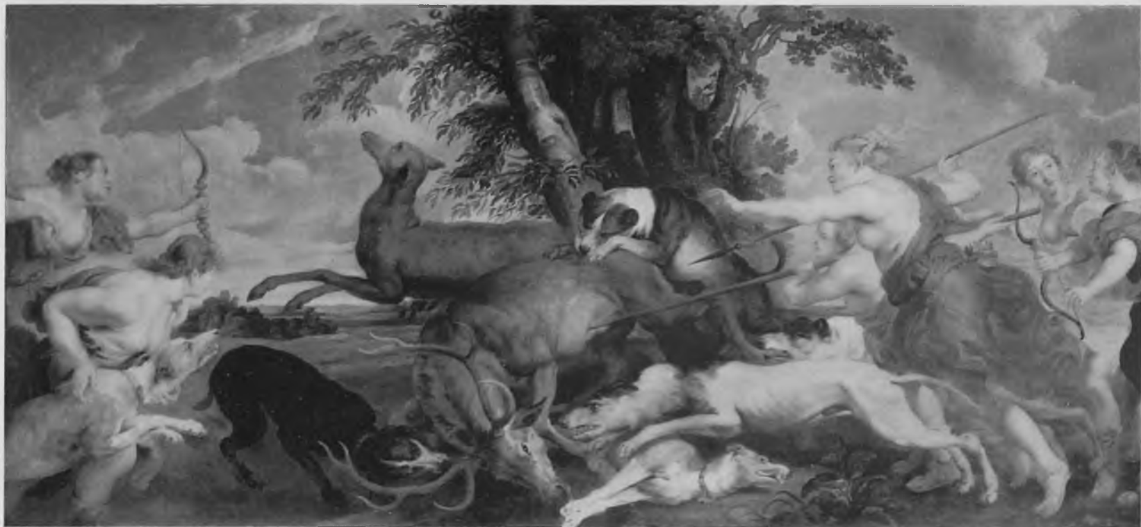
86. Studio of Rubens, Diana and Nymphs hunting Deer (No.13, copy 2). Bürgenstock, Switzerland, Coll. F.Frey