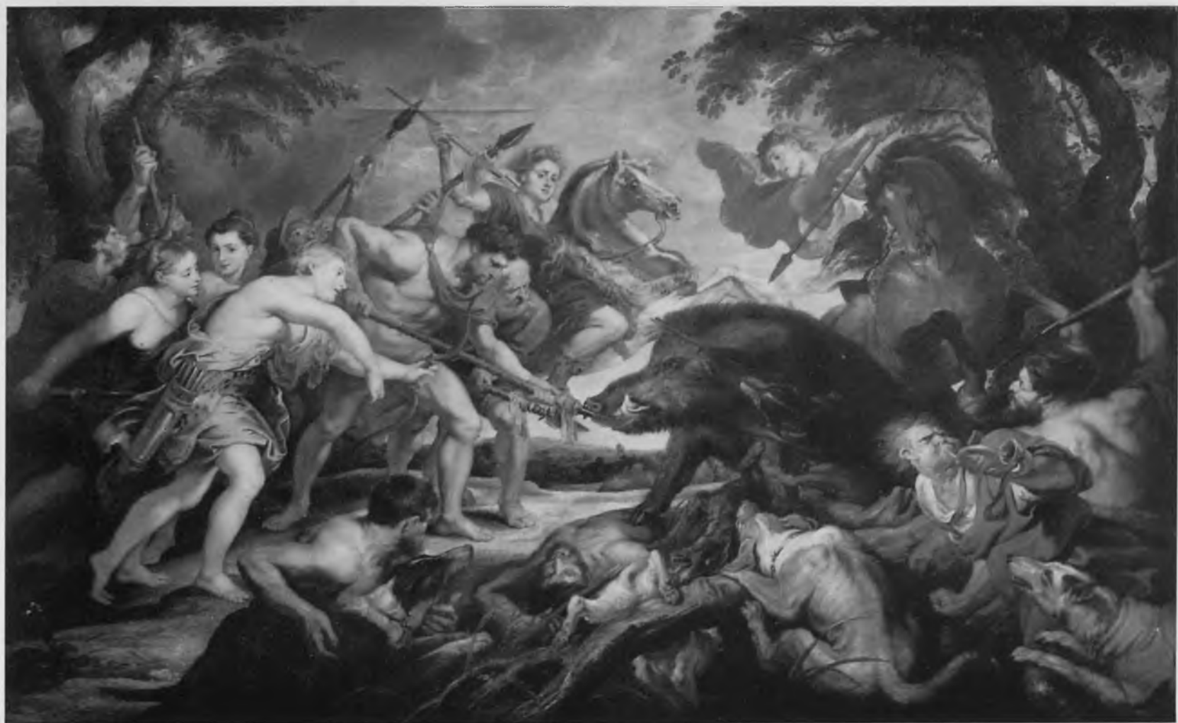
69. Rubens, The Calydonian Boar Hunt (No.10). Vienna, Kunsthistorisches Museum