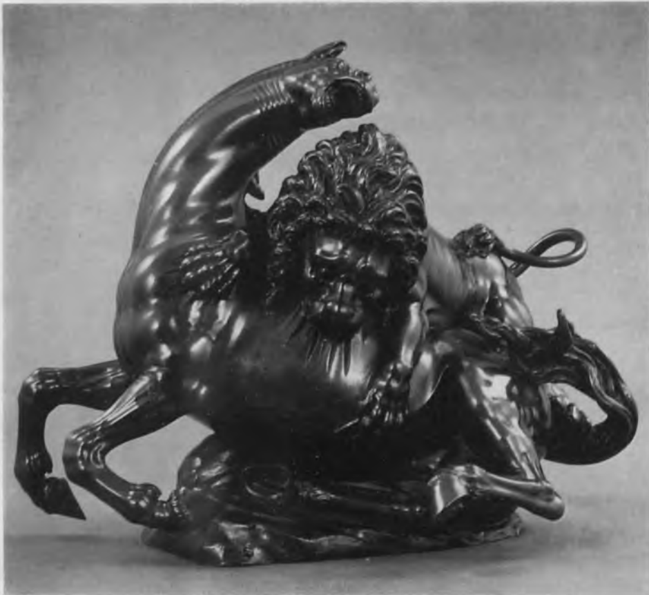
15. A. Susini after Giambologna, Lion attacking a Horse , bronze statuette. Detroit, Detroit Institute of Arts