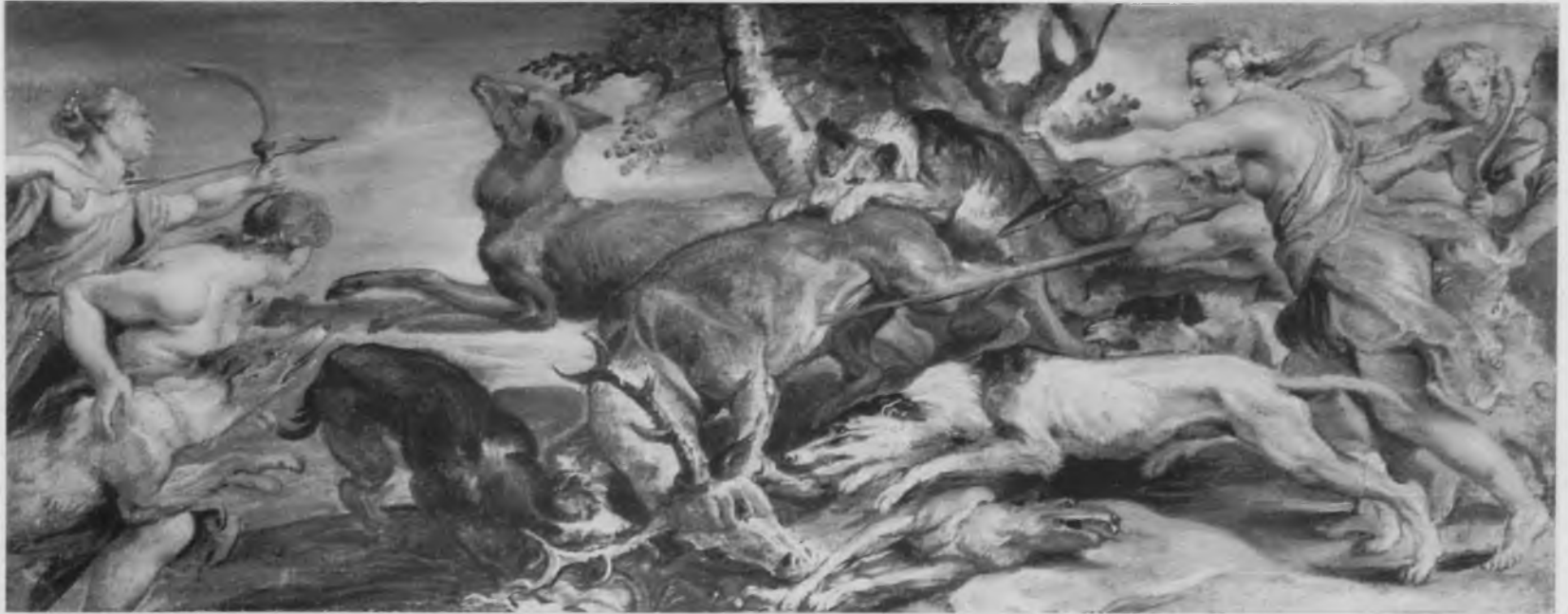
87. Rubens, Diana and Nymphs hunting Deer , oil sketch (No.13a), Switzerland, Private Collection