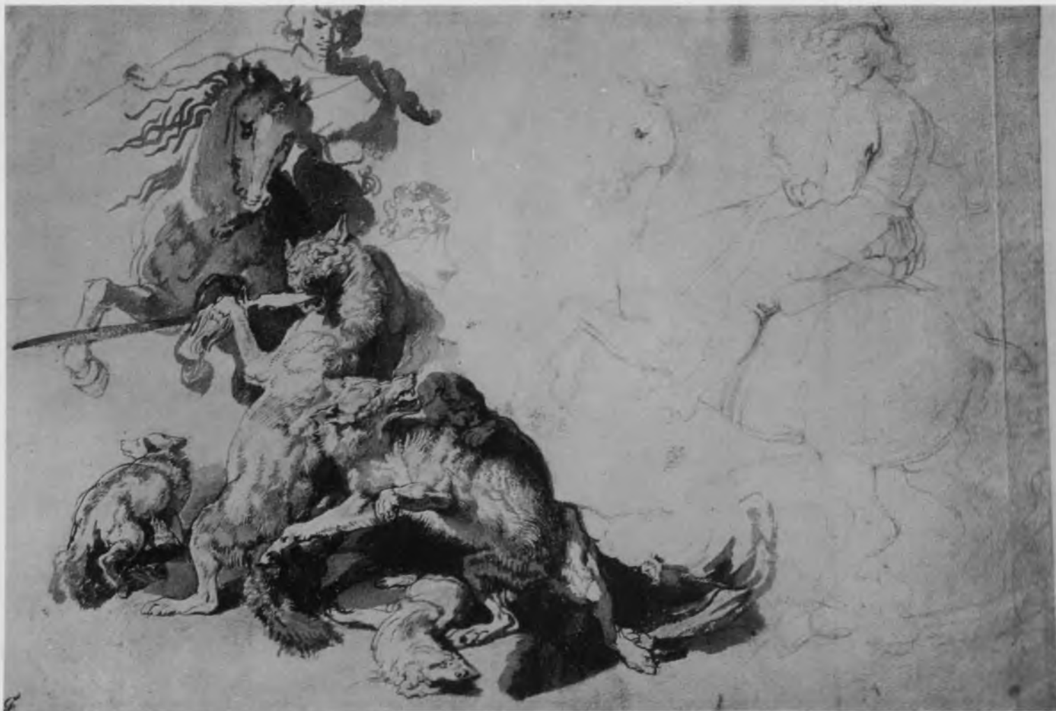
36. ?A. van Dyck, Wolf and Fox Hunt , drawing (No.2, copy 6). Chatsworth, The Trustees of the Chatsworth Settlement