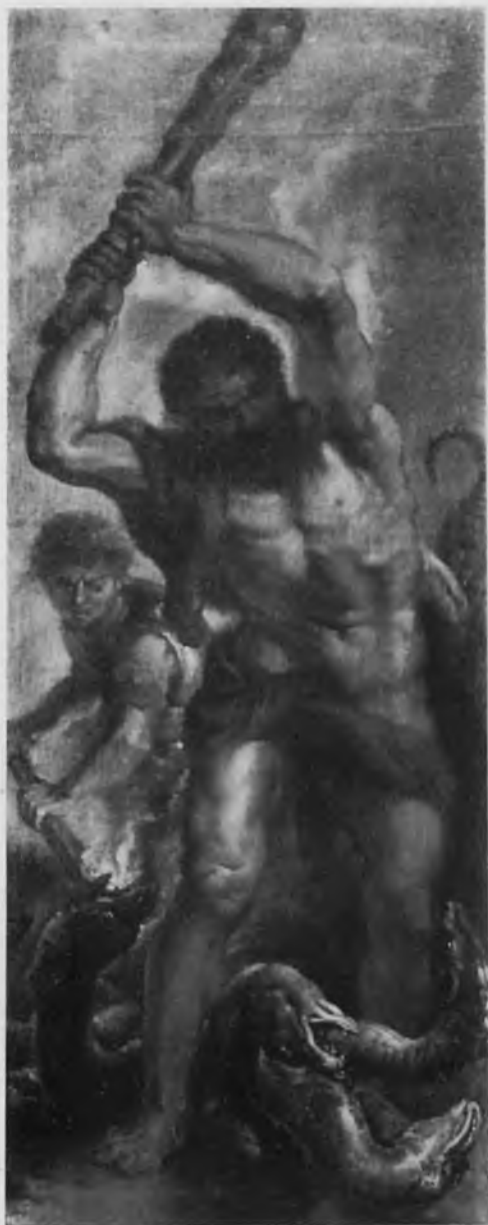
139. J.B.del Mazo after Rubens, Hercules killing the Hydra. Madrid, Prado