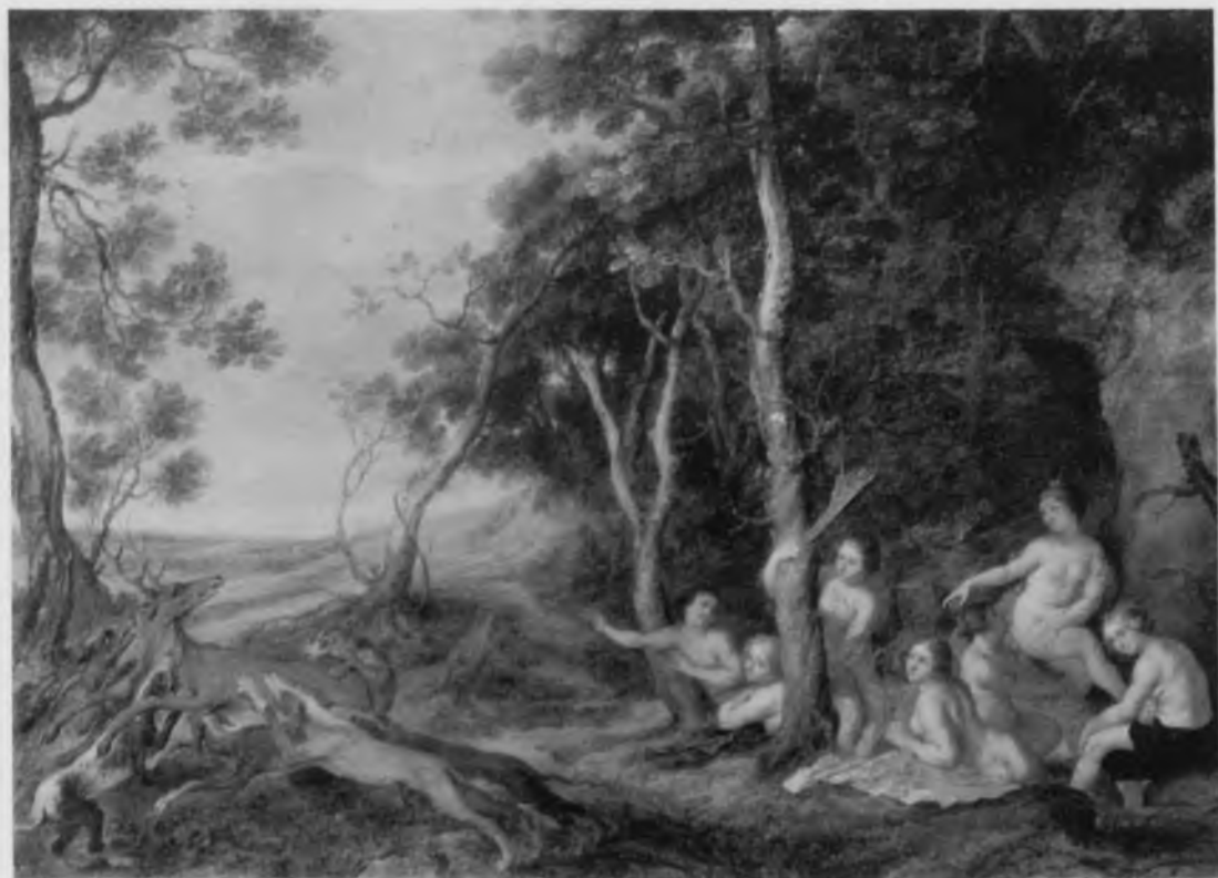
116. F. Wouters, The Death of Actaeon (No. 23, copy 2). Present whereabouts unknown