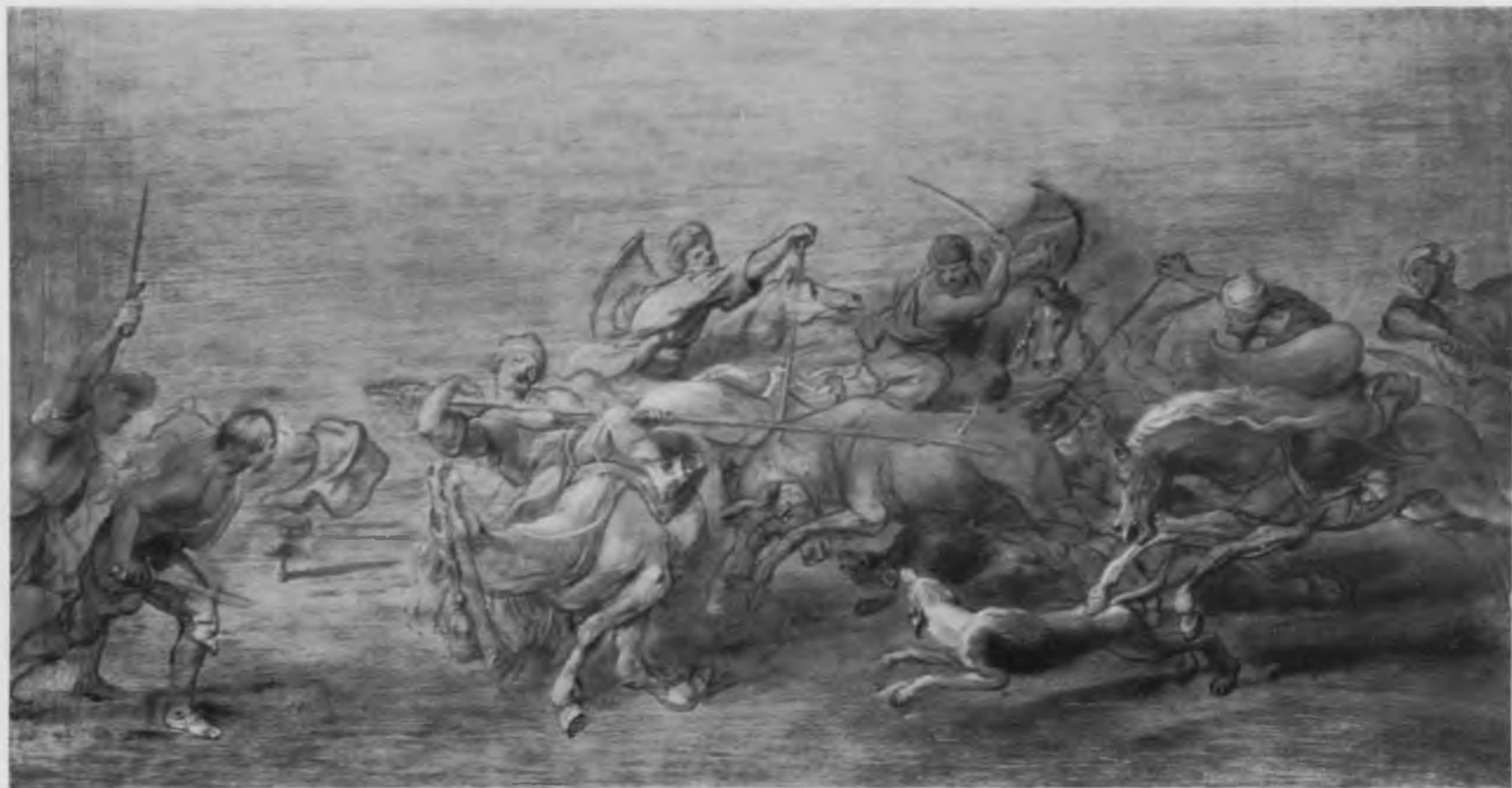
131. Rubens, Bull Hunt , oil sketch (No. 26a), U.S.A., Private Collection