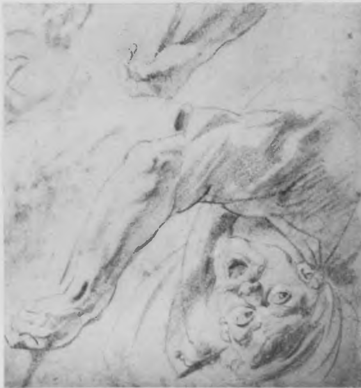
78. Rubens, Falling Man , drawing (No.11d). London, British Museum