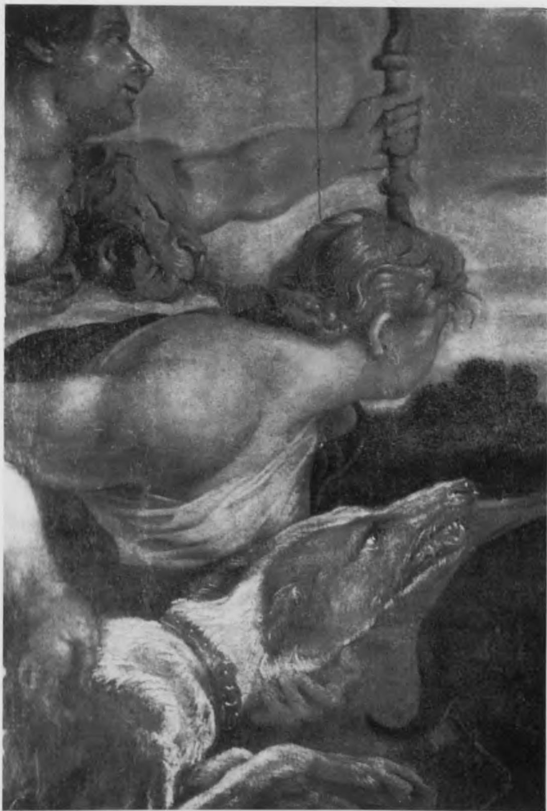
85. Detail of Fig.83, after restoration