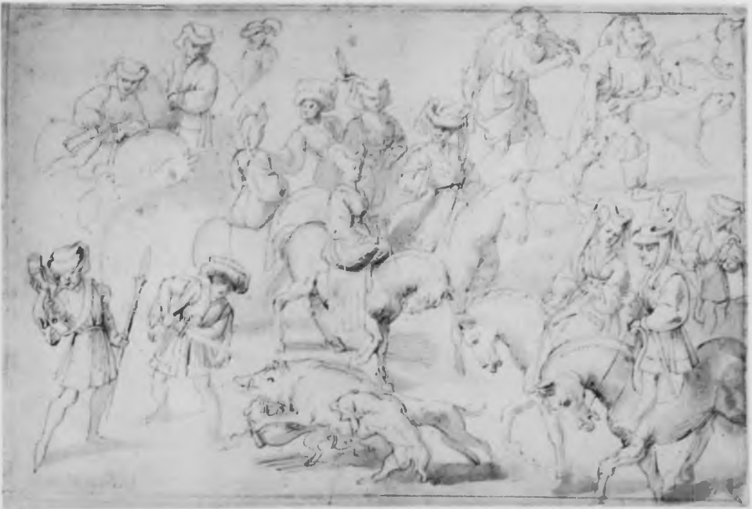
2. Rubens, Hunting Scene with Boar , drawing. Costume Book , fol.24. London, British Museum