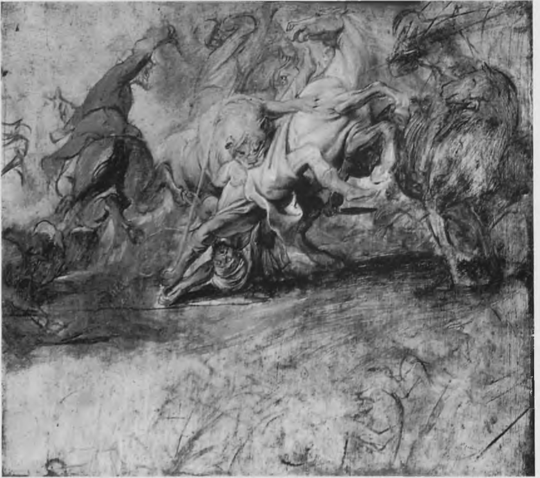
76. Rubens, Lion Hunt , oil sketch (No.11b). Houghton Hall, Norfolk, Coll. Marquess of Cholmondeley