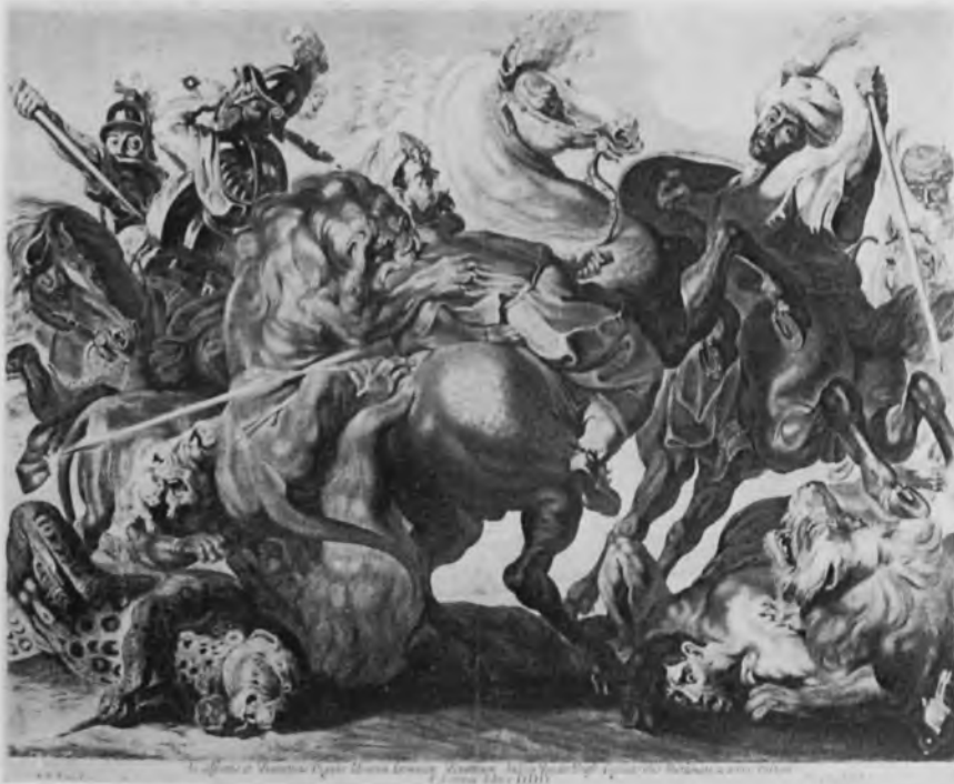
64. J. Suyderhoef, Lion and Leopard Hunt , engraving (No.8, copy 4)