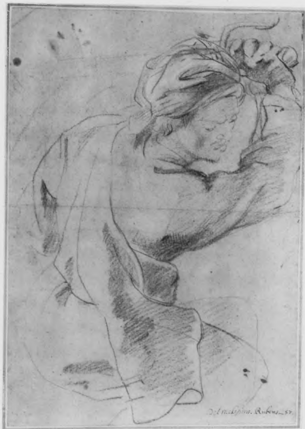
54. Rubens, Oriental Huntsman , drawing (No.6b). Present whereabouts unknown