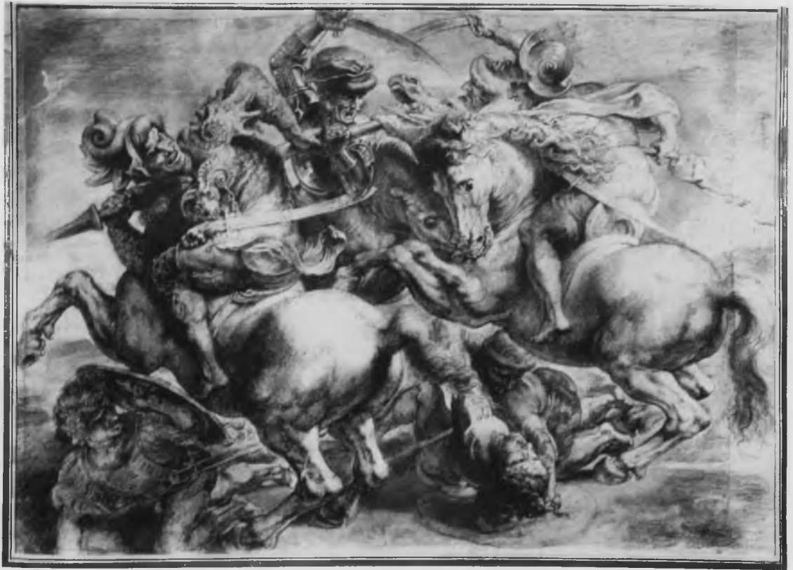
30. Rubens after Leonardo, The Battle of Anghiari , drawing. Paris, Cabinet des Dessins du Musée du Louvre