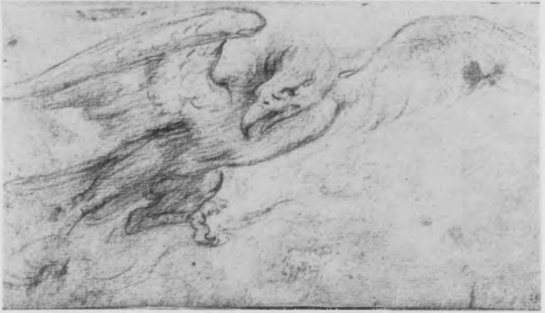
96. Rubens, An Eagle with Thunderbolt in its Claws , drawing (No.16c). Bayonne, Musée Bonnat