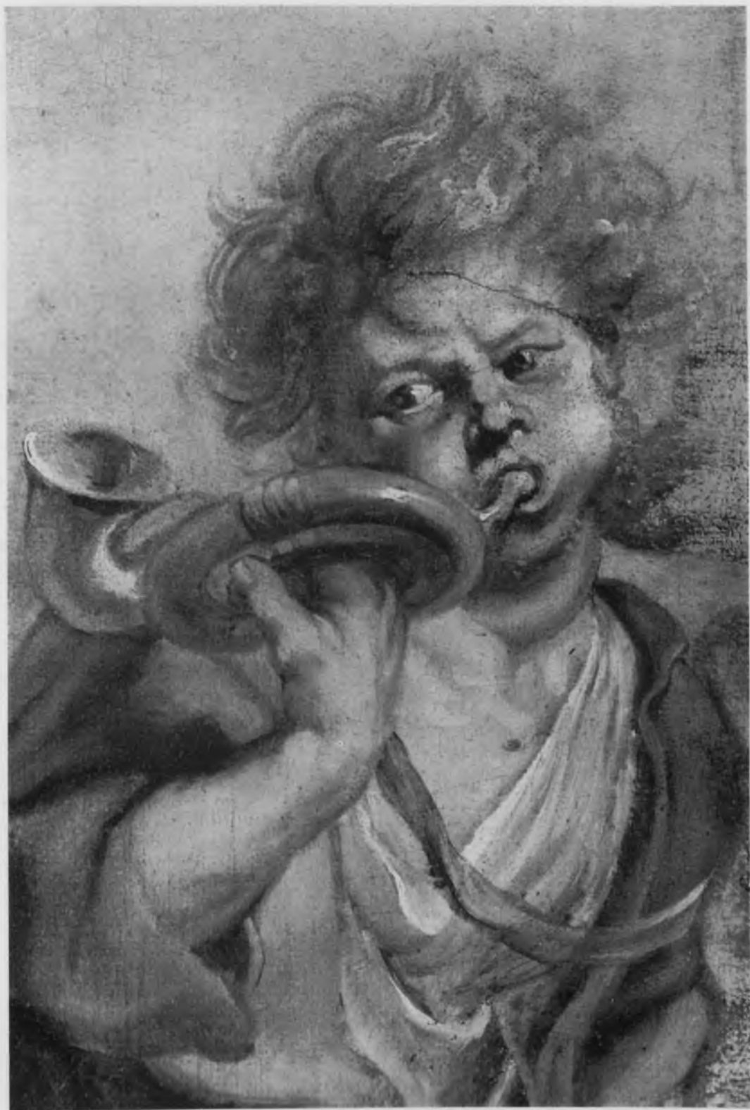
136. Detail of Fig.132