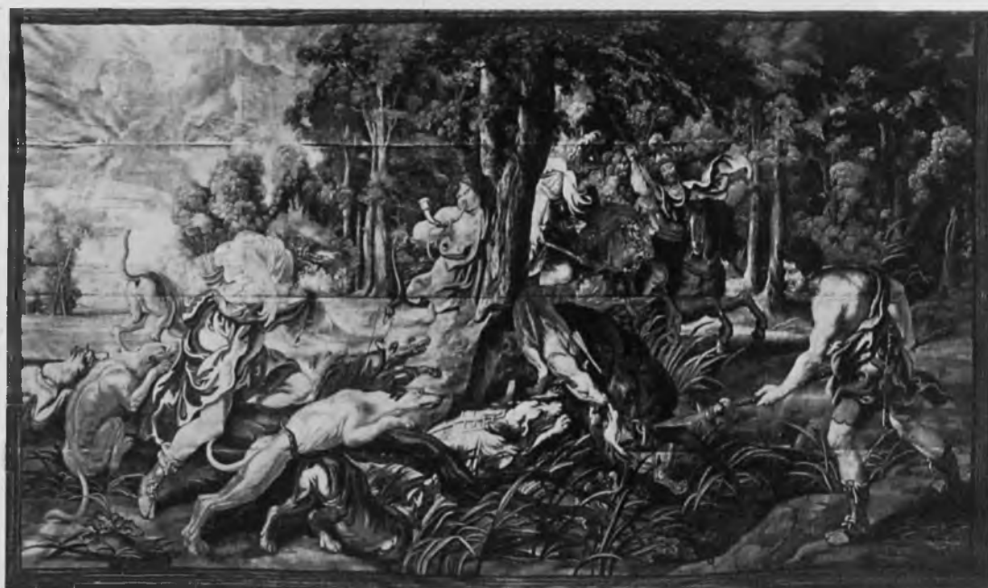
107. D.Eggermans (?the Younger), The Calydonian Boar Hunt , tapestry (No.20, copy 12). Present whereabouts unknown