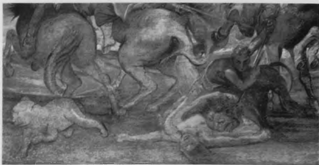
68. Condition of Fig.65 in 1936(?), detail