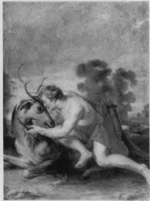
144. J.B.del Mazo after Rubens, Cyparissus and the Stag. Present whereabouts unknown