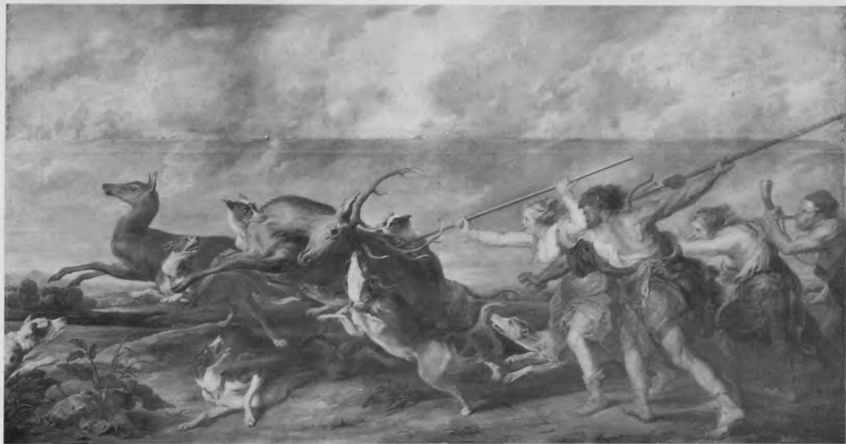
104. Rubens and F.Snyders, Diana with Attendants hunting Deer (No.19). Formerly Berlin, Kaiser Friedrich Museum, now lost