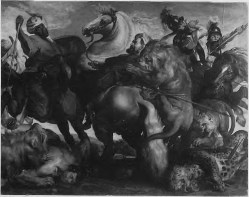
63. Rubens, Lion and Leopard Hunt (No.8) . Dresden, Gemäldegalerie