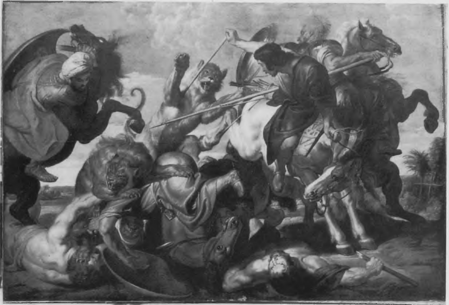
51. Studio of Rubens, Lion Hunt (No.6, copy 1). Madrid, Private Collection