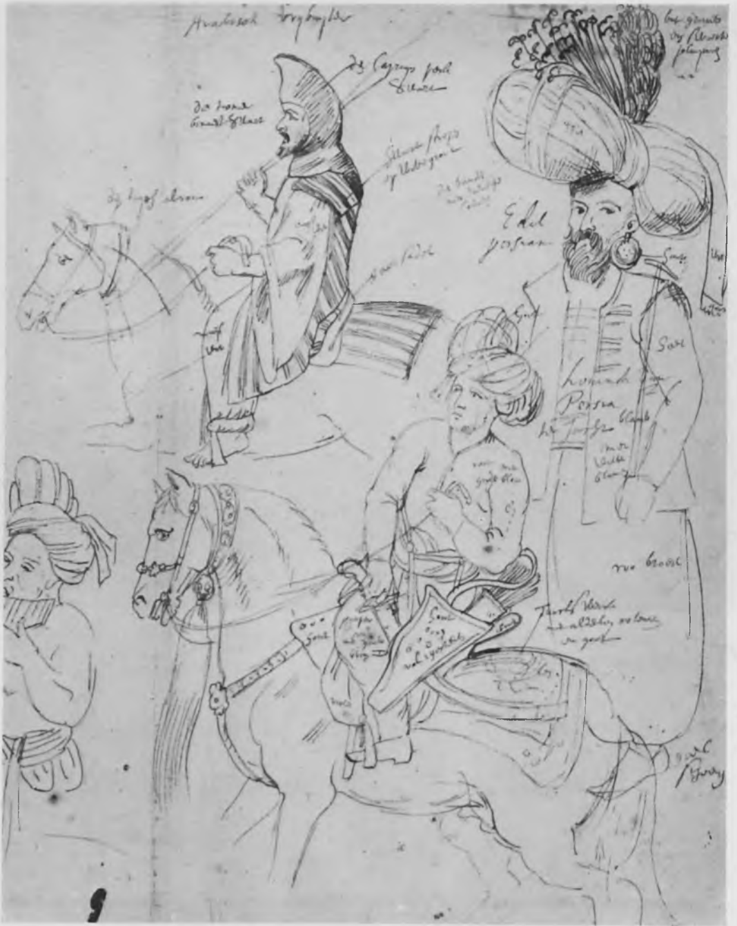
66. Rubens, Figures in Oriental Costume , drawing. Costume Book , fol.39. London, British Museum