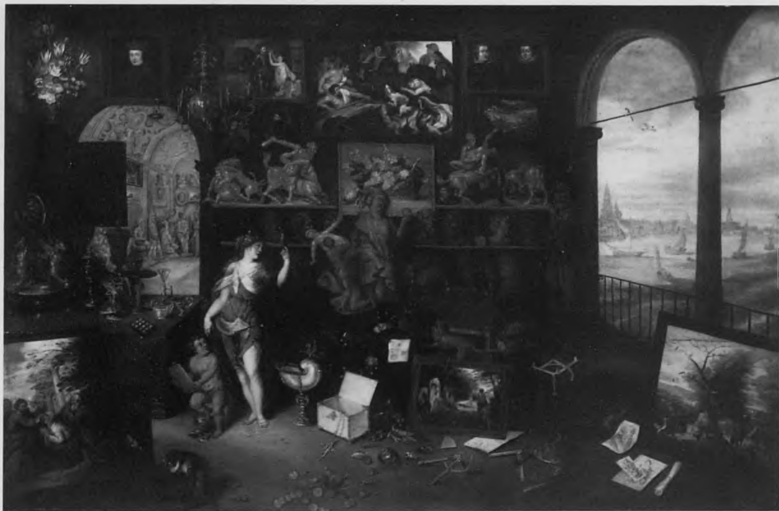
44. After J. van Kessel(?), Kunstammer with Venus (No.4, copy 10). Present whereabouts unknown