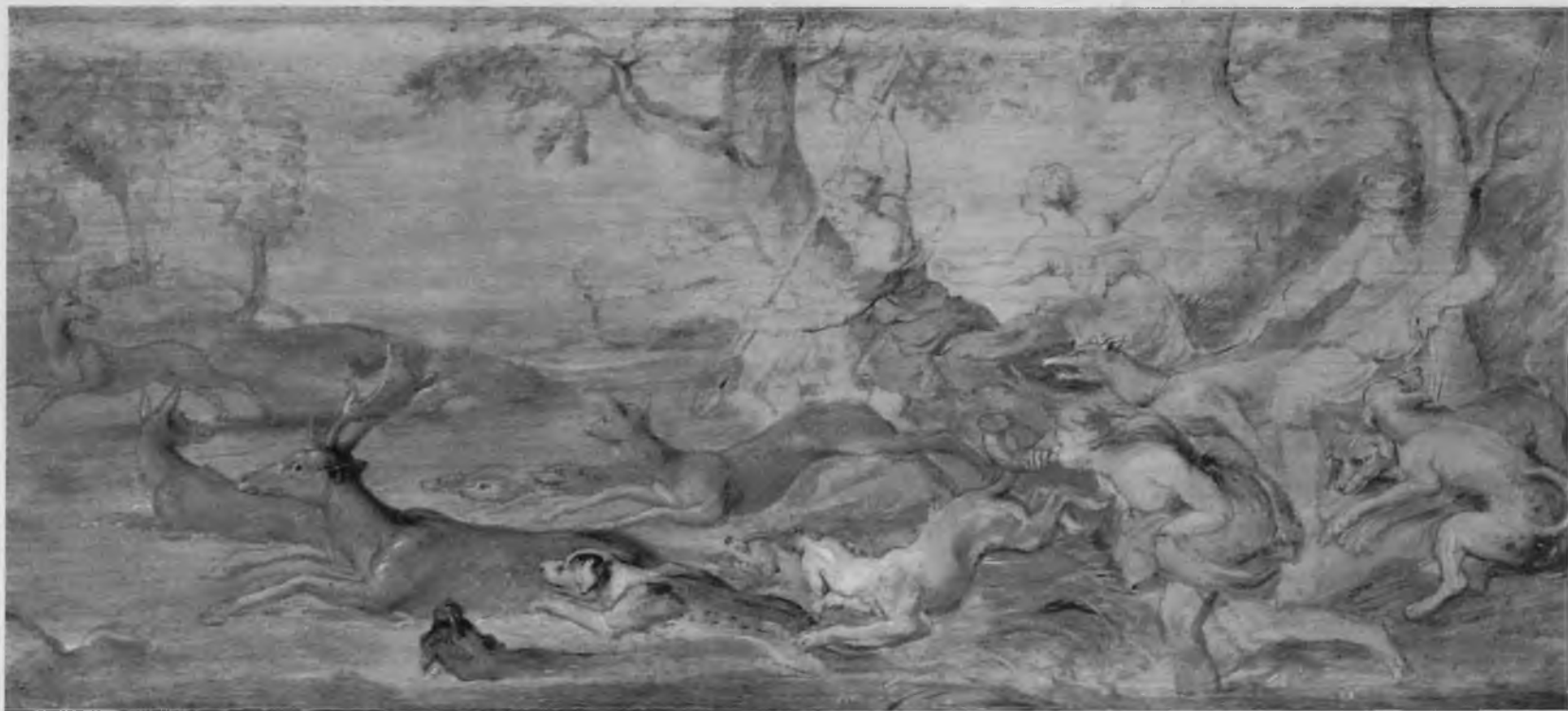
110. Rubens, Diana and Nymphs hunting Fallow Deer , oil sketch (No.21a). Belgium, Private Collection