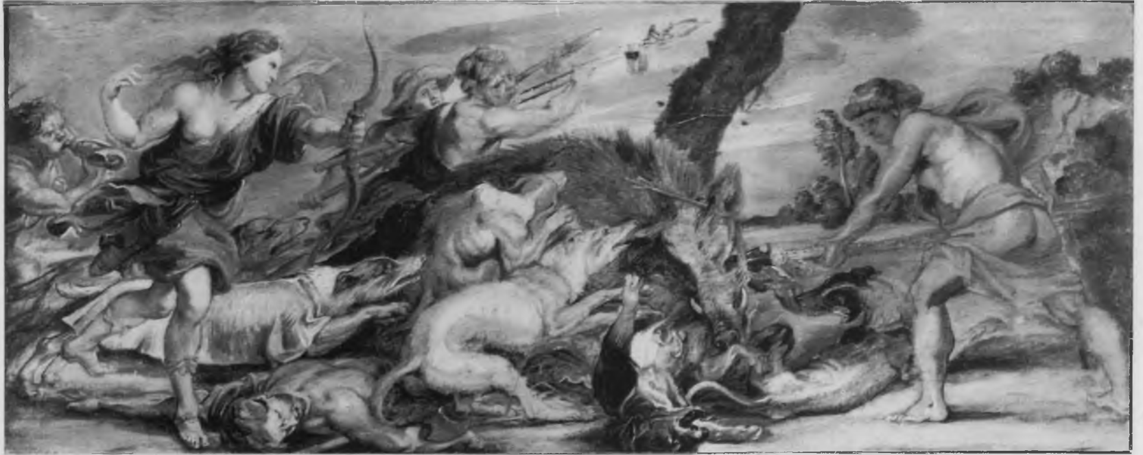
82. Rubens, The Calydonian Boar Hunt , oil sketch (No.12a). Switzerland, Private Collection