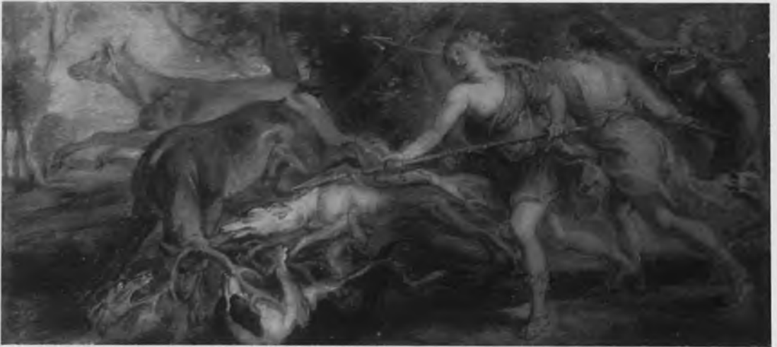
6. Rubens, Diana and Nymphs hunting Deer , oil sketch. Luton Hoo, Bedfordshire, Wernher Collection