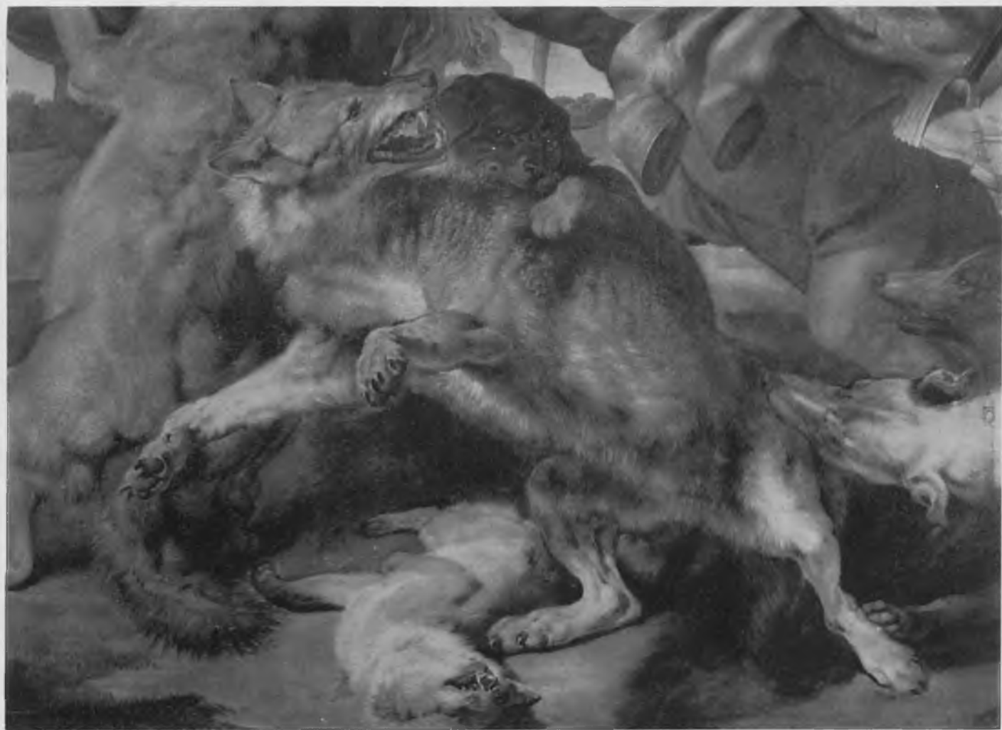
35. Detail of Fig.33