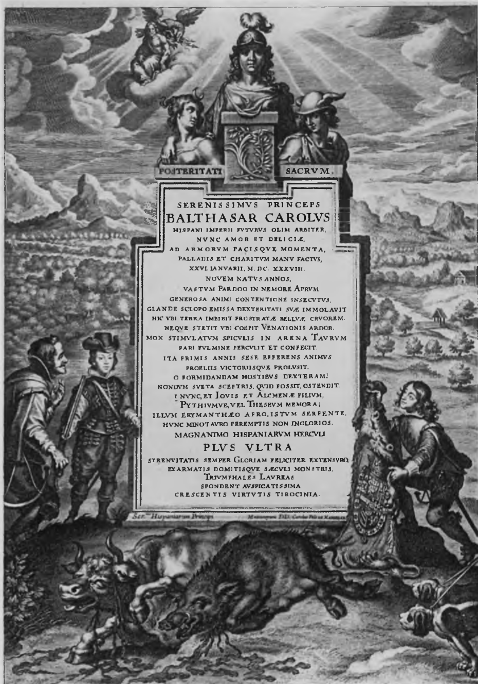
145. C.Galle, A Hunting Exploit of the Infante Baltasar Carlos , engraved title-page