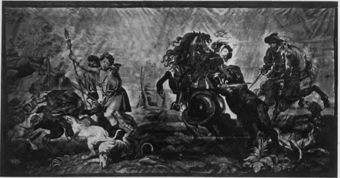
135. D.Eggermans (?the Younger), Bear Hunt , tapestry (No.27, copy 6). Present whereabouts unknown