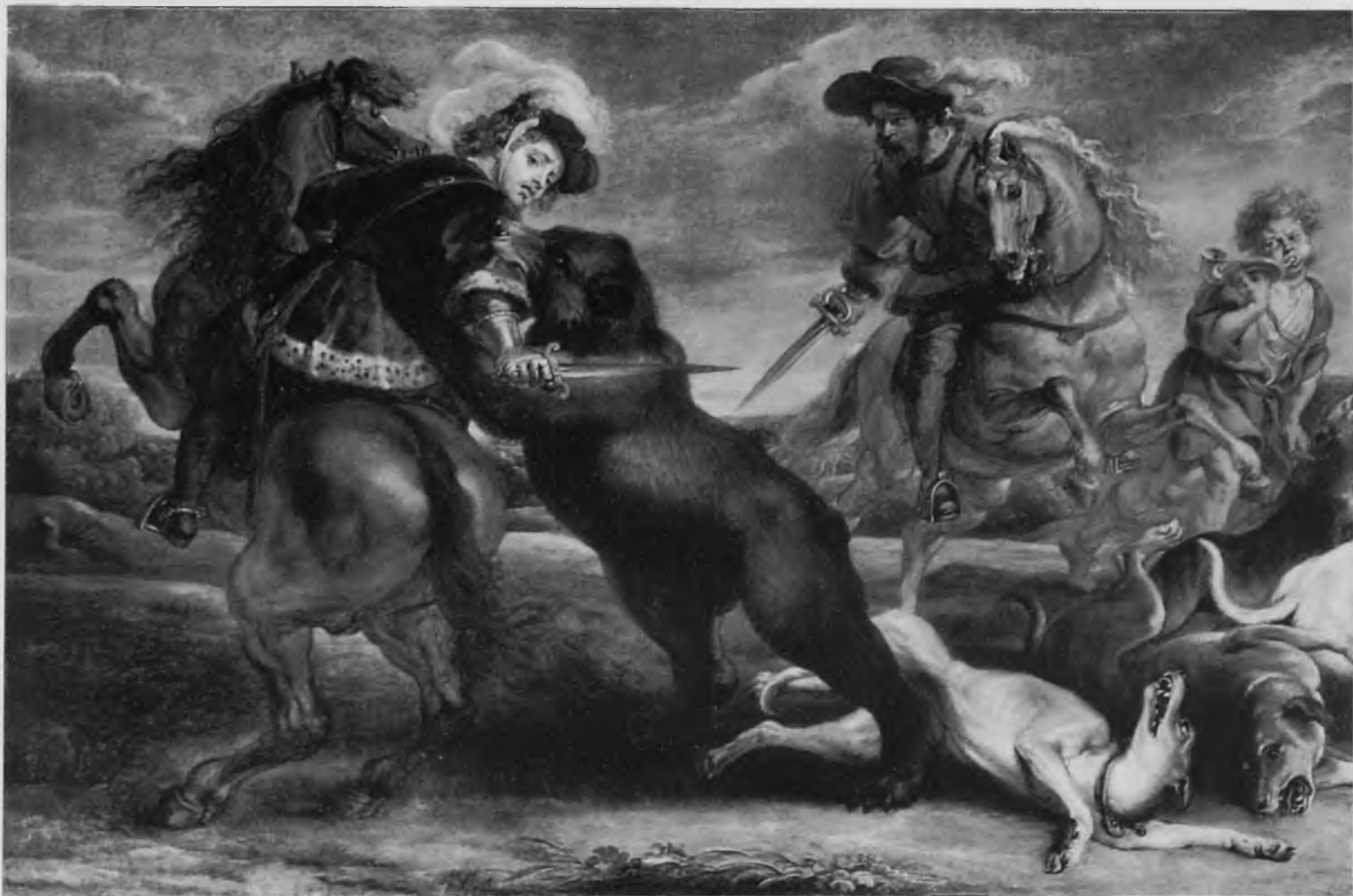
132. Rubens and F.Snyders, Bear Hunt (No.27). Raleigh, N.C., North Carolina Museum of Art