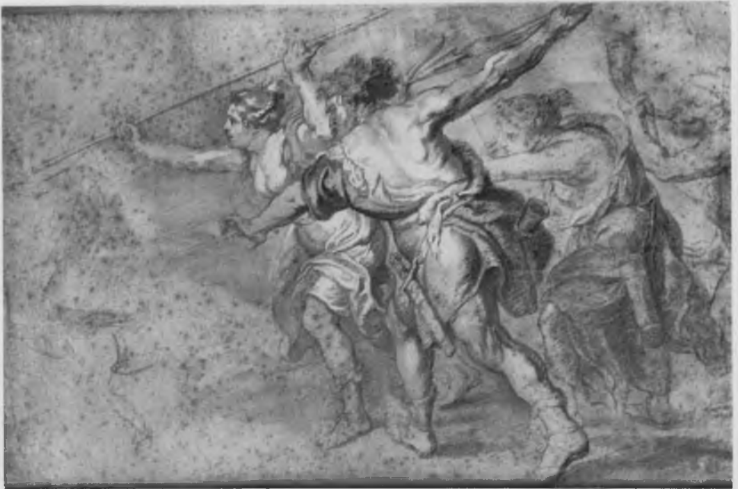
103. After Rubens, Diana with Attendants hunting Deer , drawing (No.19, copy 6). Paris, Cabinet des Dessins du Musée du Louvre