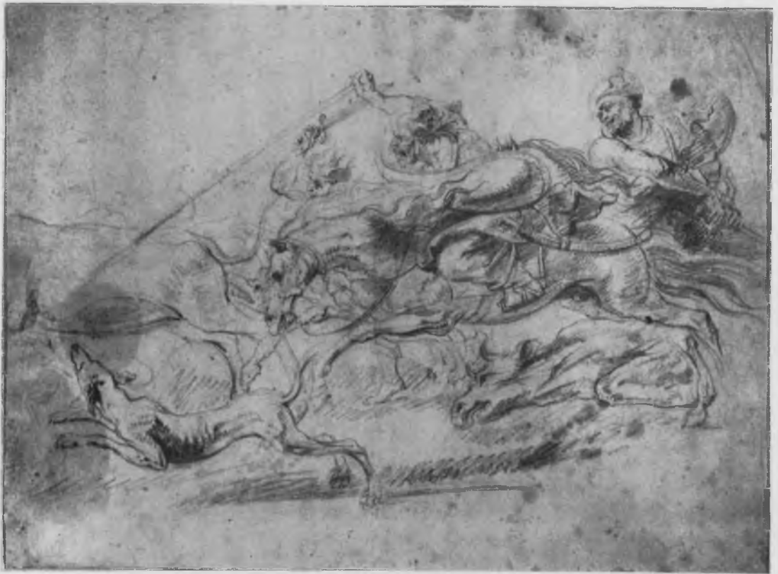
129. After Rubens and F. Snyders, Bull Hunt , drawing (No.26, copy 15). Berlin-Dahlem, Staatliche Museen, Kupferstichkabinett