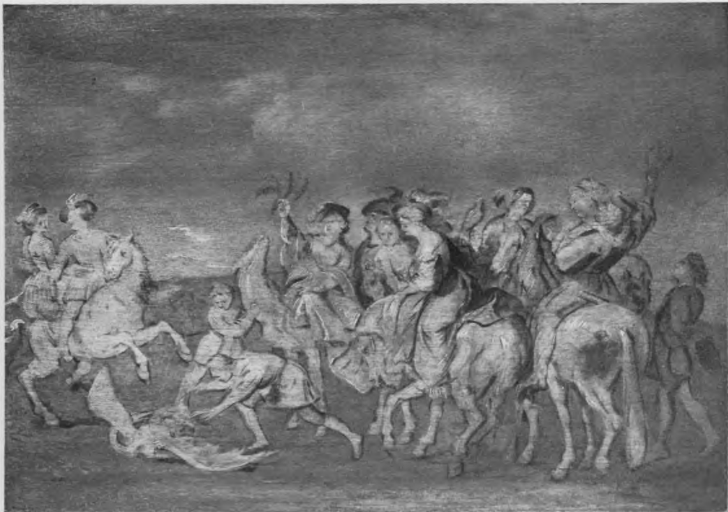
92. ?Rubens, Hawking Party , oil sketch (No.15). Present whereabouts unknown