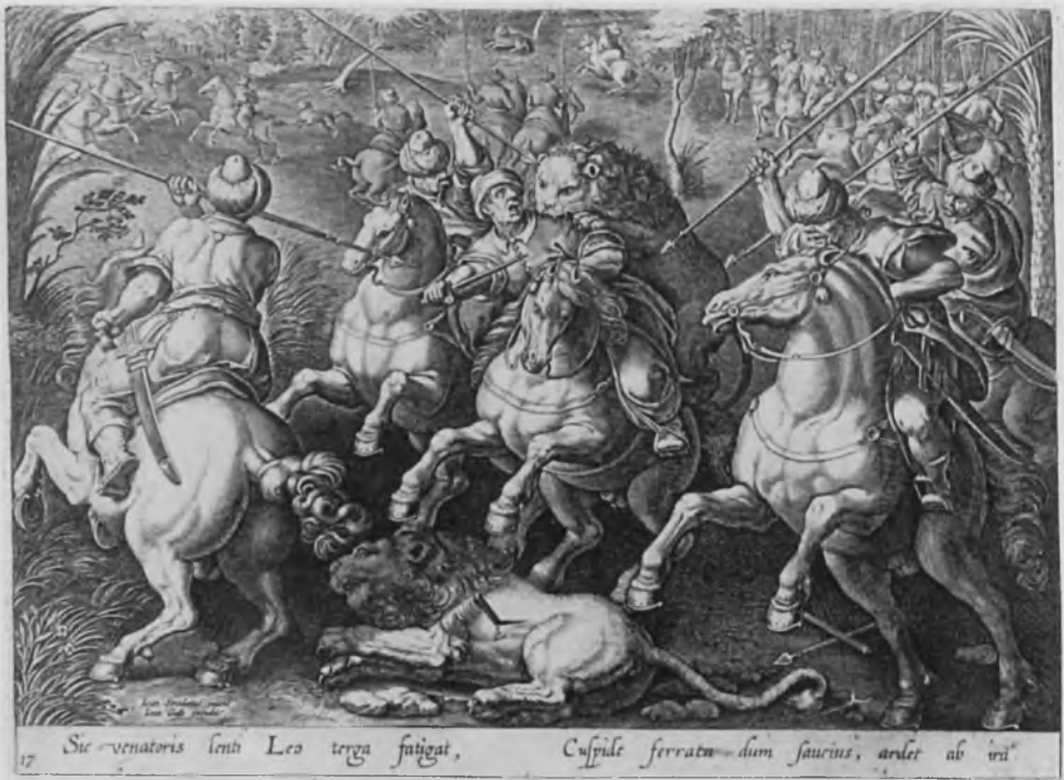
18. J.Galle after Stradanus, Lion Hunt , engraving