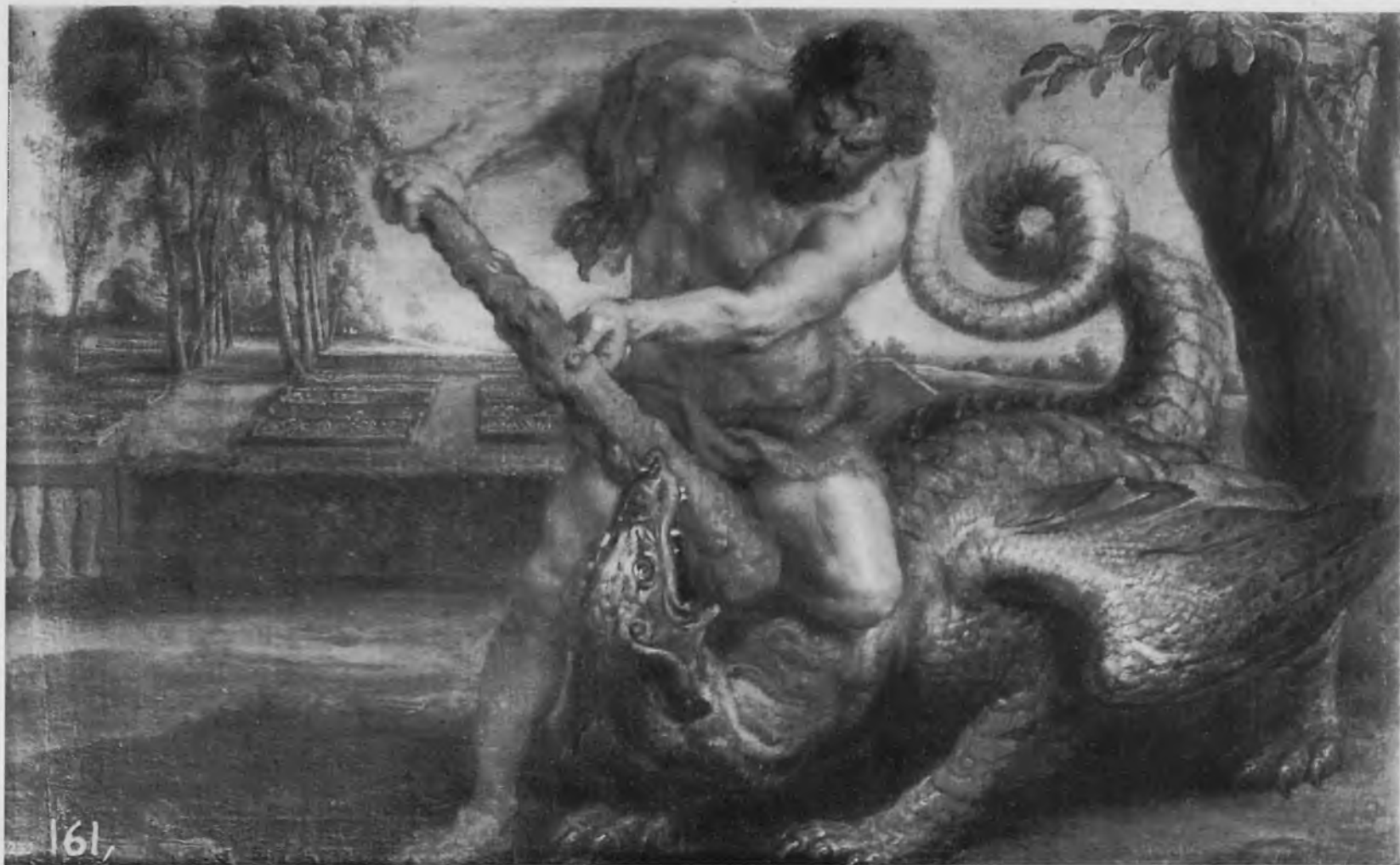
137. Rubens, Hercules slaying the Dragon . Madrid, Prado