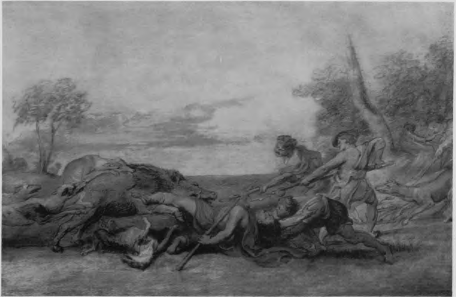
119. Rubens, The Death of Adonis , oil sketch (No.24a). Princeton, N.J., The Art Museum, Princeton University