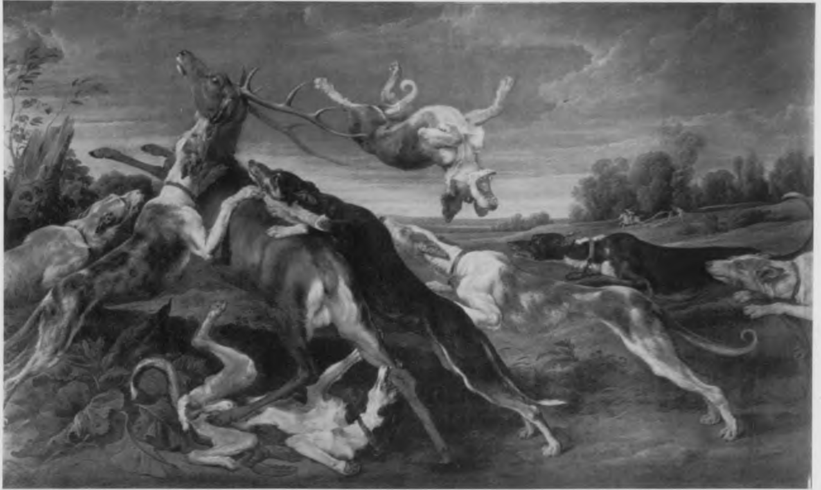
10. P. de Vos, Deer Hunt . Brussels, Musées Royaux des Beaux-Arts