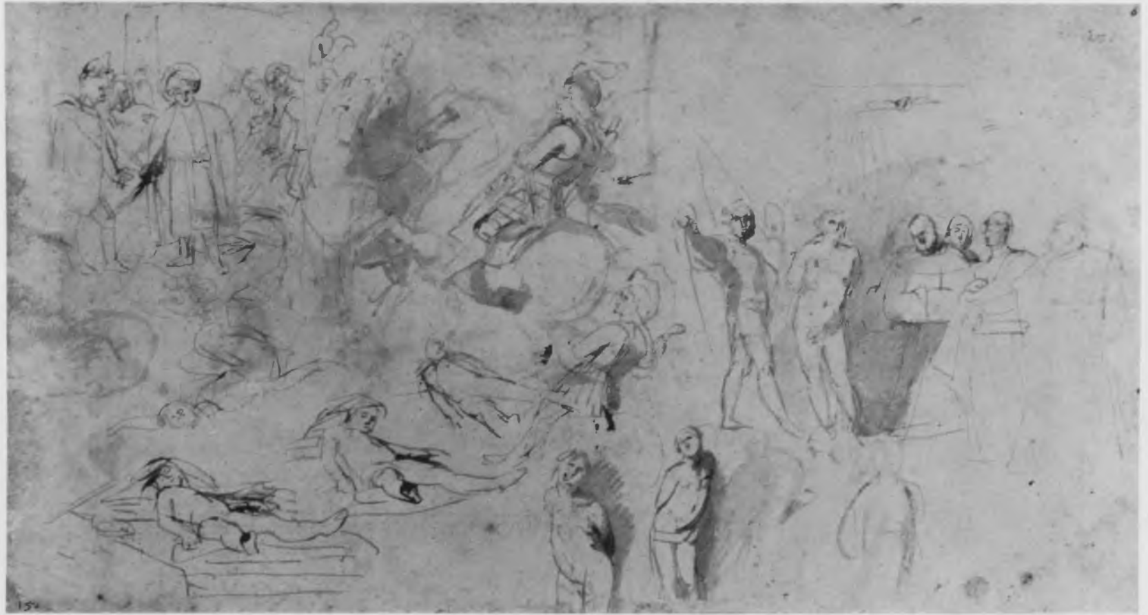
38. Rubens, Studies for Various Compositions , drawing (No.2a). Windsor Castle, Coll. H.M. the Queen