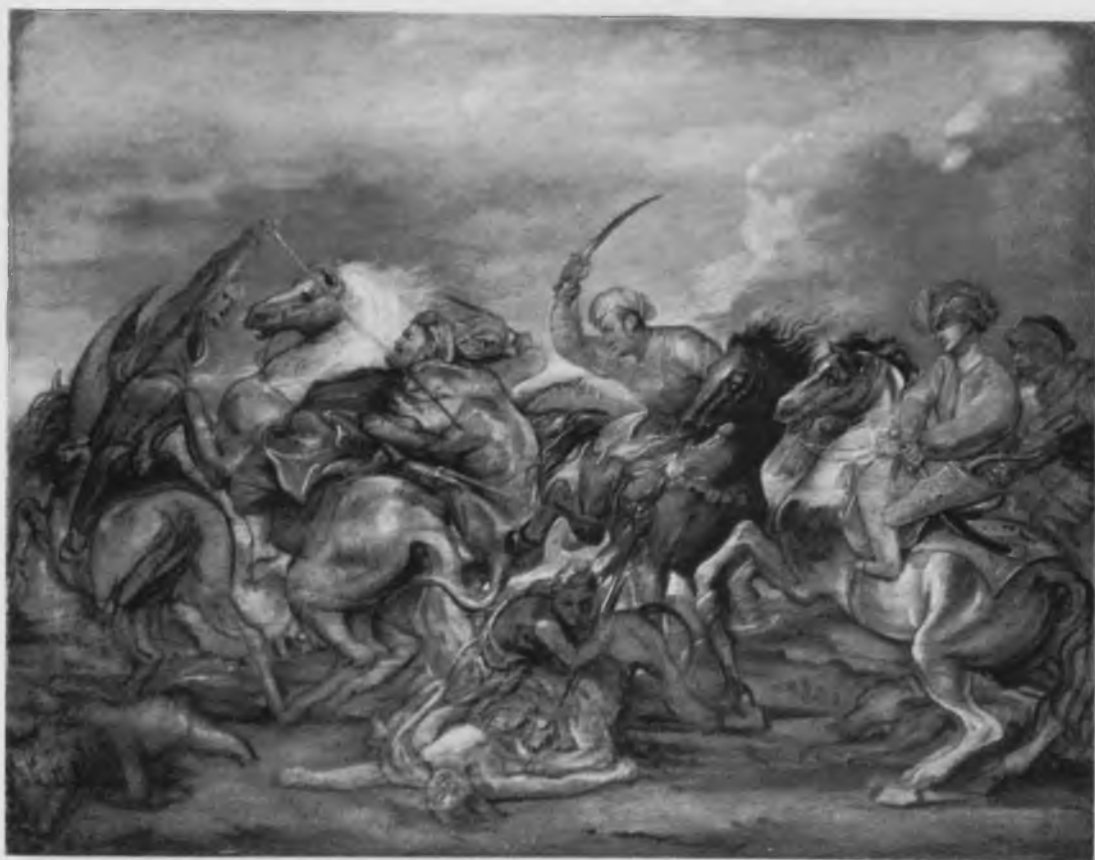
67. Condition of Fig.65 in 1938