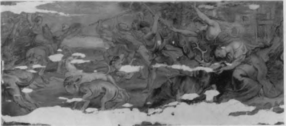
123. Fig.122, photographed during restoration