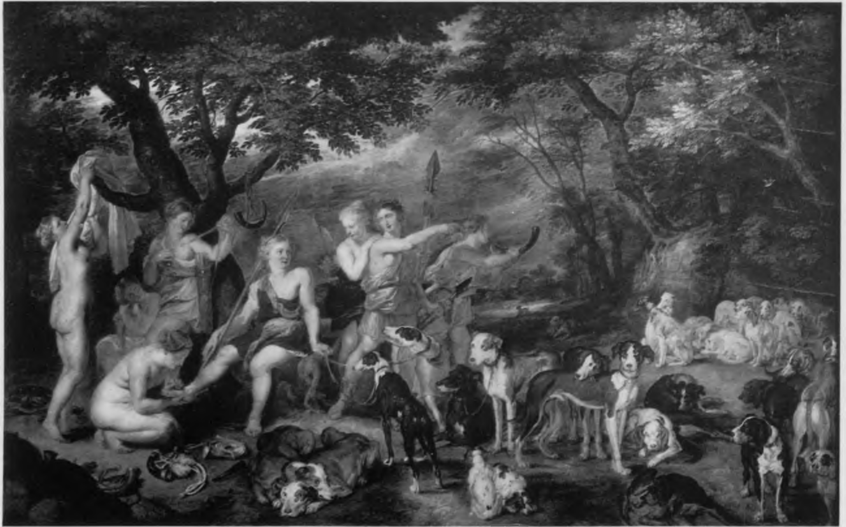
5. Rubens and J.Brueghel, Diana and Nymphs setting out for the Hunt . Paris, Musée de la Chasse et de la Nature