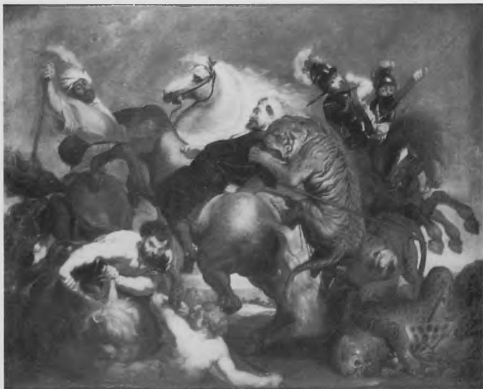
59. Retouched by Rubens, Tiger, Lion and Leopard Hunt (No.7b). Rome, Galleria Nazionale d'Arte Antica, Palazzo Corsini