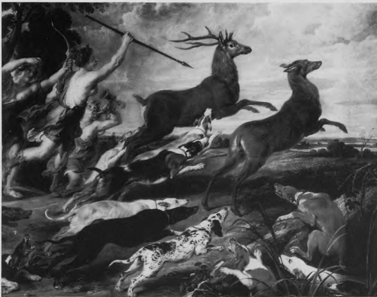
98. Rubens and P. de Vos, Diana and Nymphs hunting Deer (No.17). U.S.A., Private Collection