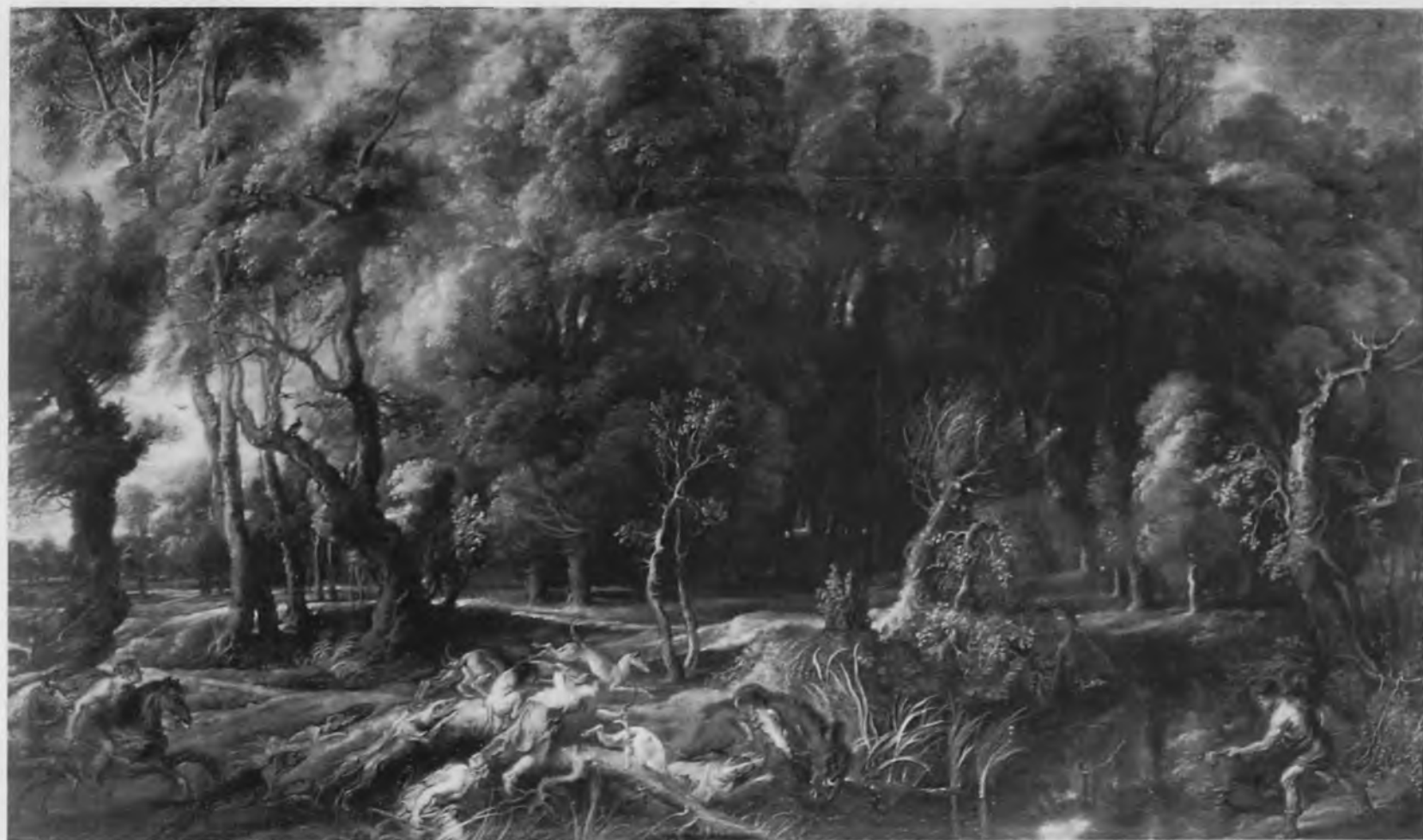
25. Rubens, Landscape with the Calydonian Boar Hunt . Madrid, Prado