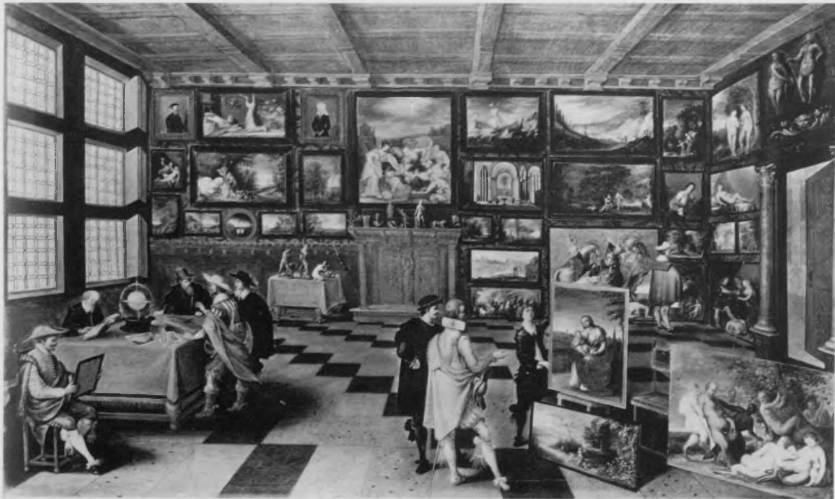
45. Hieronymus Francken II, Kunstammer (No.5, copy 10). Brussels, Musées Royaux des Beaux-Arts