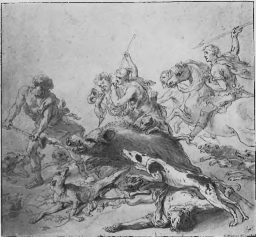
101. After Rubens and F.Snyders, The Calydonian Boar Hunt , drawing (No.18, copy 5). London, British Museum