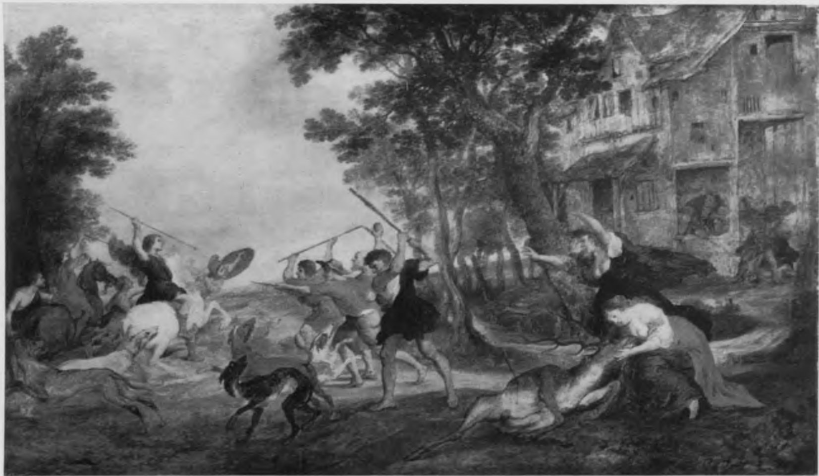
125. F. Wouters, The Death of Silvia's Stag (No. 25, copy 3). Present whereabouts unknown