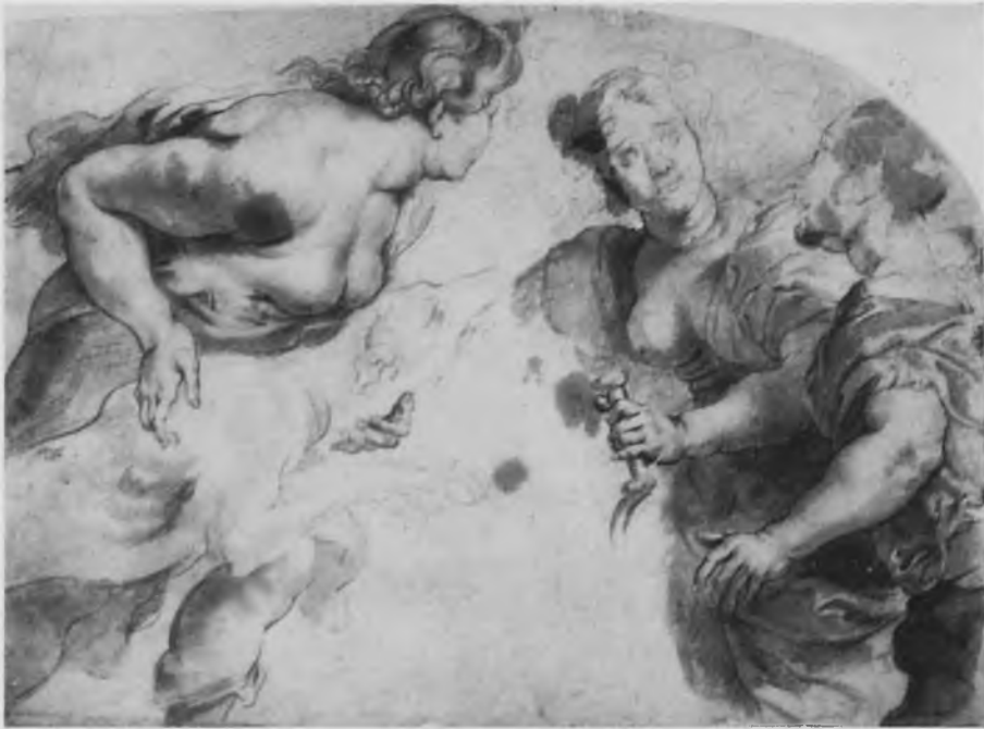
88. After Rubens, Diana and Nymphs hunting Deer , drawing (No.13, copy 10). Copenhagen, Statens Museum for Kunst