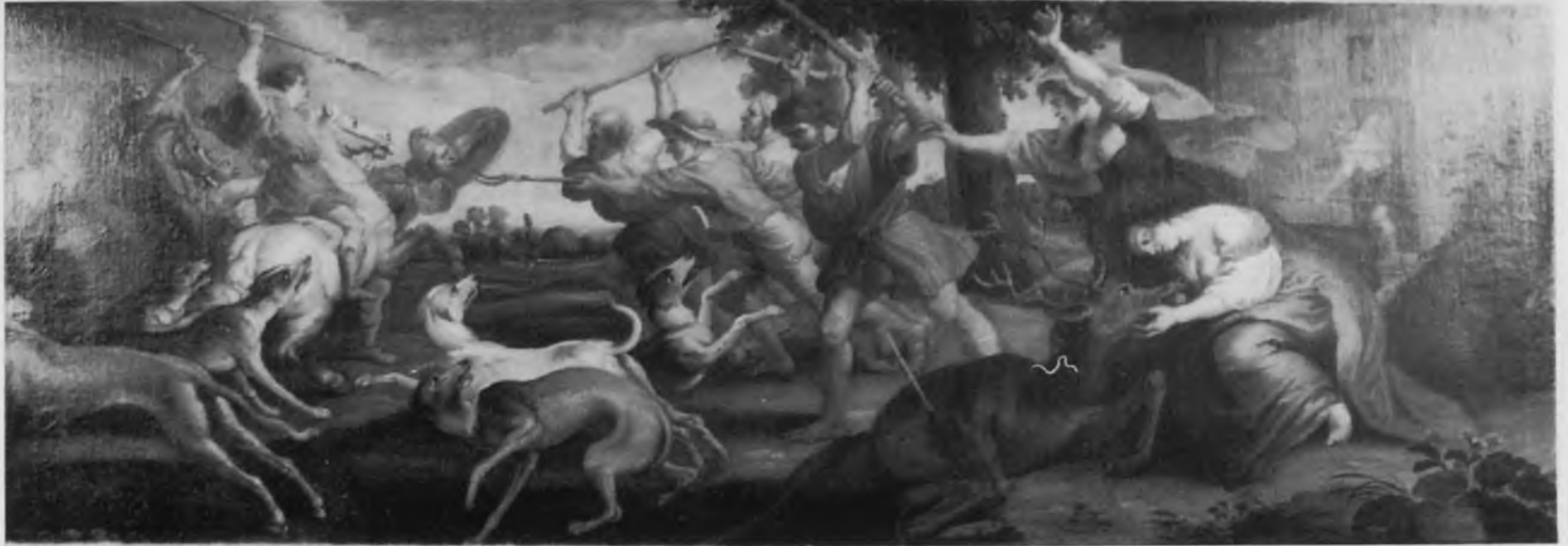
124. ?Rubens and F.Snyders, The Death of Silvia's Stag (No.25). Gerona, Museo Arqueológico Provincial