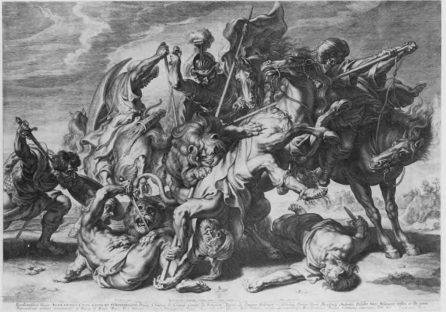
80. S. a Bolswert, Lion Hunt , engraving (No.11e, copy 8)