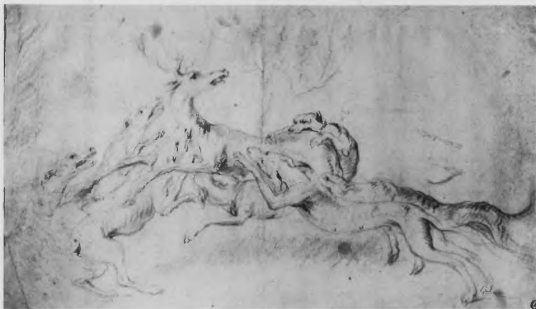
117. After Rubens and F. Snyders, The Death of Actaeon , drawing (No. 23, copy 6). Present whereabouts unknown