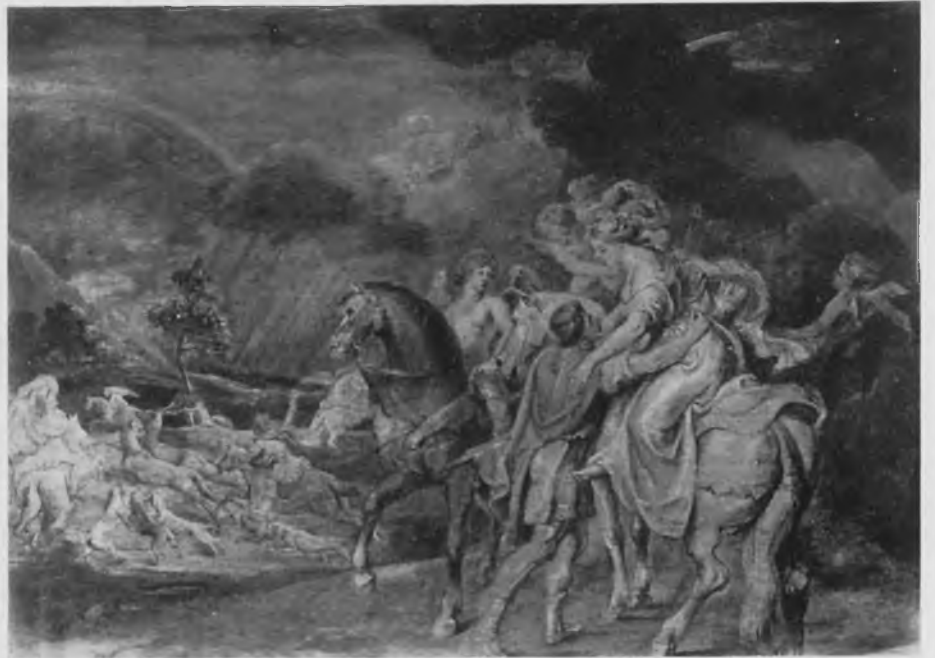
4. Rubens, Aeneas helping Dido to dismount , oil sketch. Present whereabouts unknown