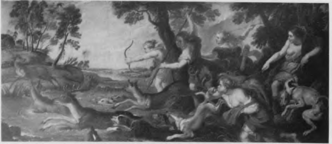
108. After Rubens and F.Snyders, Diana and Nymphs hunting Fallow Deer (No.21, copy 1). Nîmes, Musée des Beaux-Arts