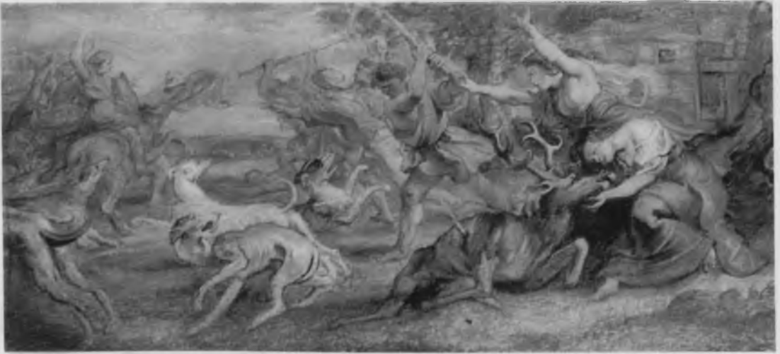
122. Rubens, The Death of Silvia's Stag , oil sketch (No.25a). Philadelphia, Pa., Museum of Art, Coll. John G. Johnson