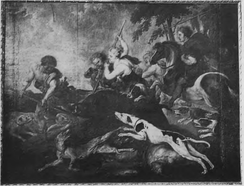
100. After Rubens and F.Snyders, The Calydonian Boar Hunt (No.18, copy 2). Present whereabouts unknown