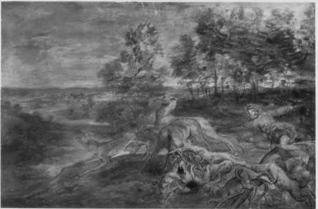
7. Rubens, Deer Hunt , oil sketch. Antwerp, Koninklijk Museum voor Schone Kunsten