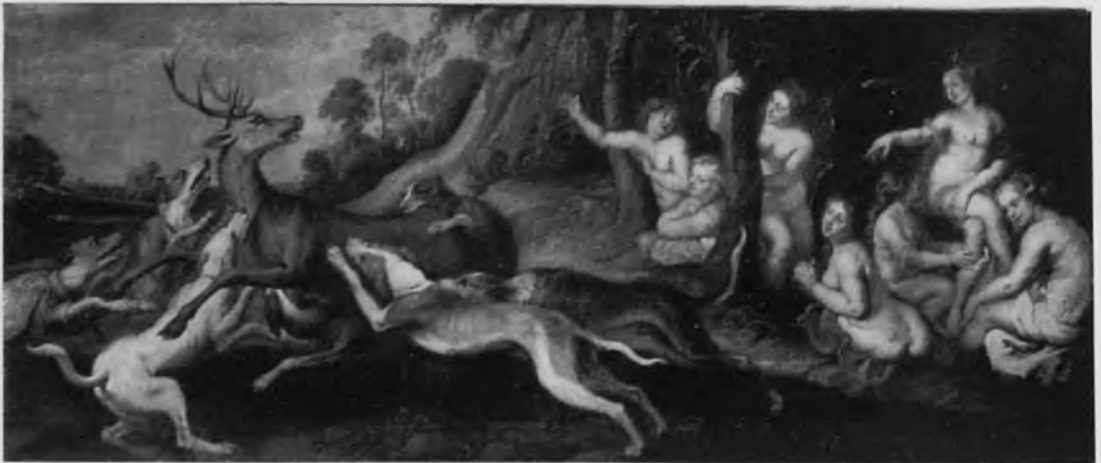
115. After Rubens and F.Snyders, The Death of Actaeon (No.23, copy 1). Nimes, Musée des Beaux-Arts