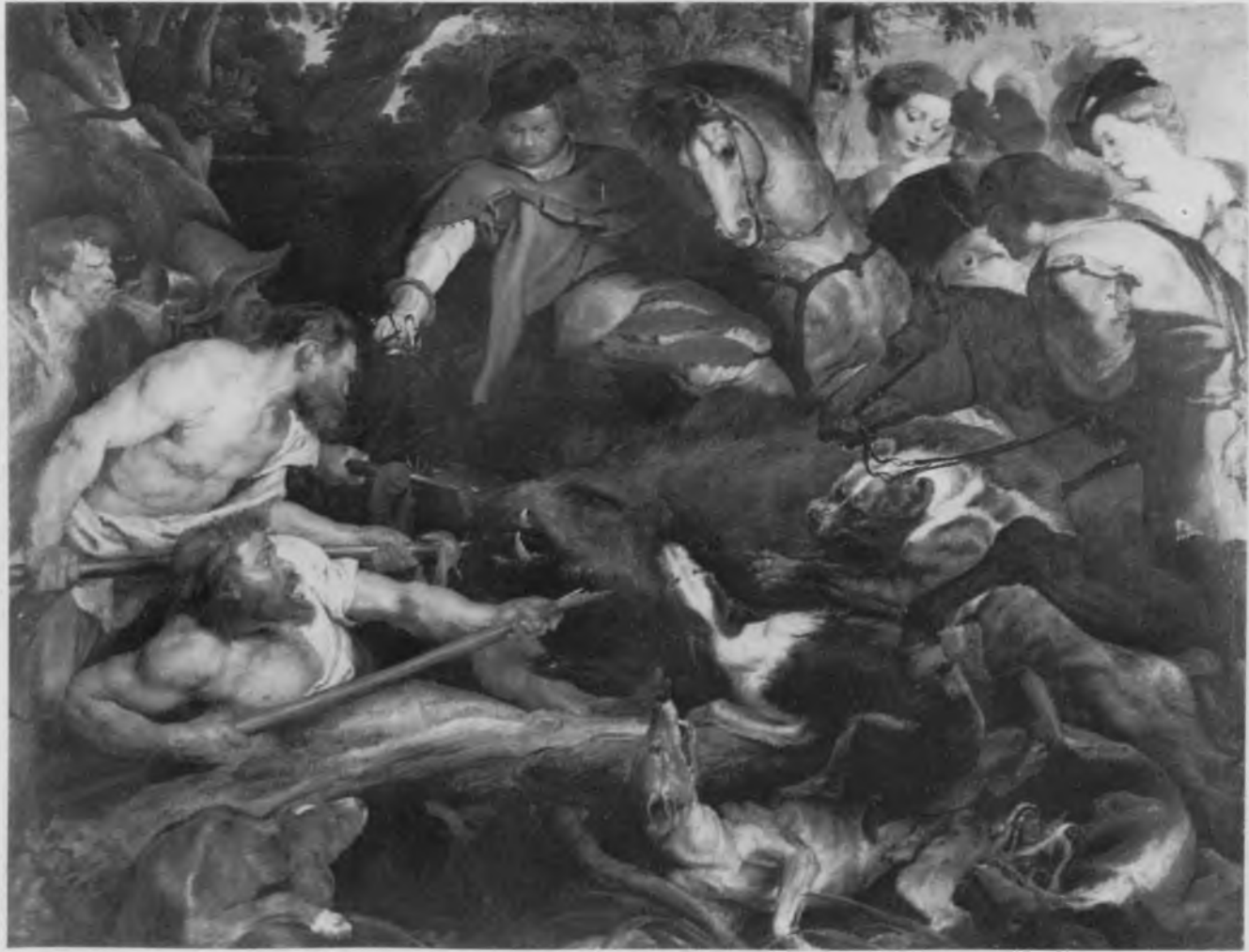
40. Rubens, Boar Hunt (No.4) . Marseilles, Musée des Beaux-Arts