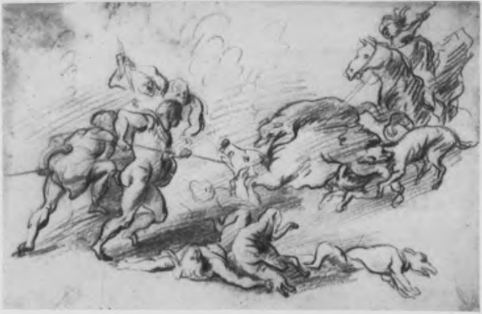
29. After Giulio Romano, The Calydonian Boar Hunt , drawing. Copenhagen, Statens Museum for Kunst