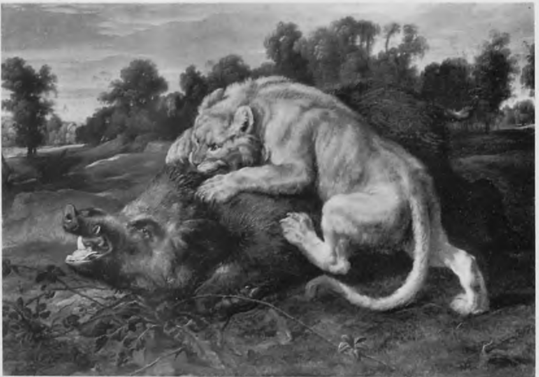
22. F. Snyders, Lioness attacking a Boar . Munich, Alte Pinakothek