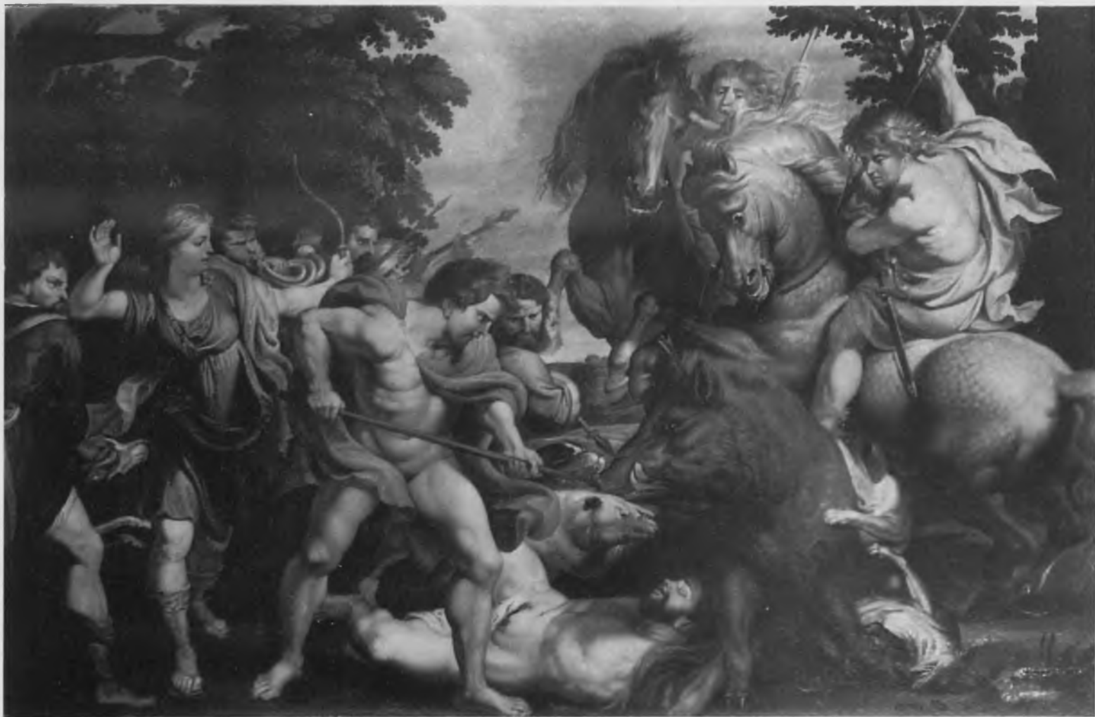
31. After Rubens, The Calydonian Boar Hunt (No.1, copy 1). Present whereabouts unknown