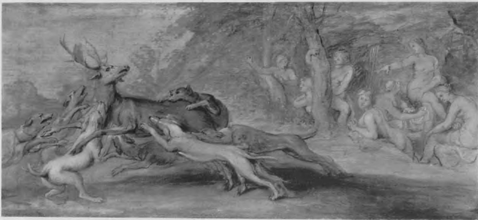
118. Rubens, The Death of Actaeon , oil sketch (No.23a). Belgium, Private Collection