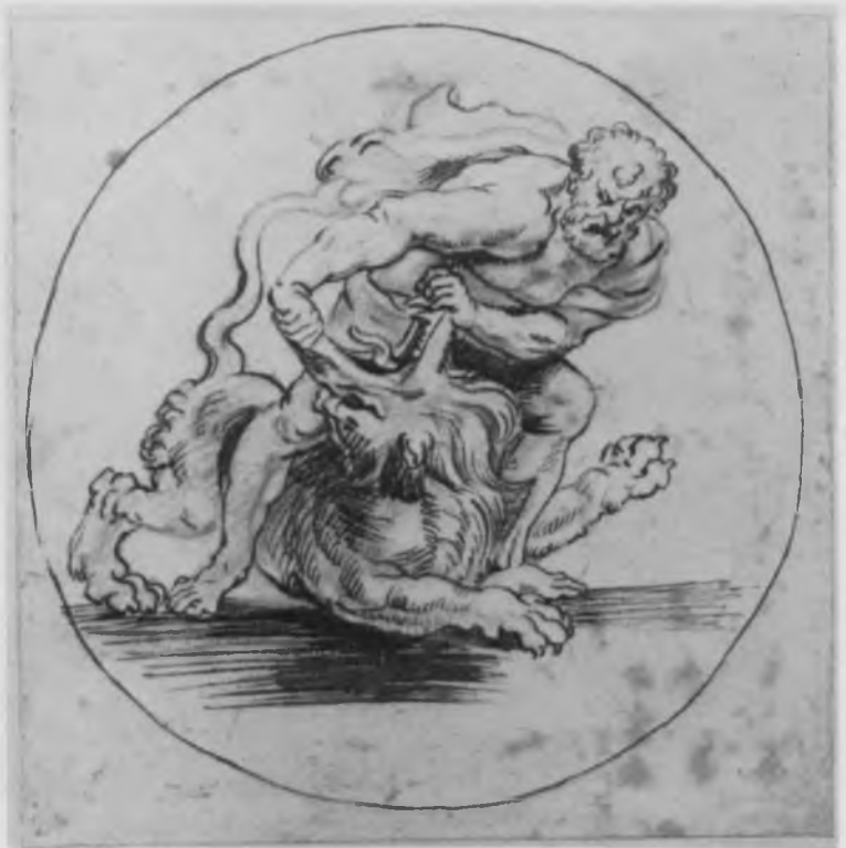
62. Rubens, Samson and the Lion , drawing. Paris, Fondation Custodia, Institut Néerlandais