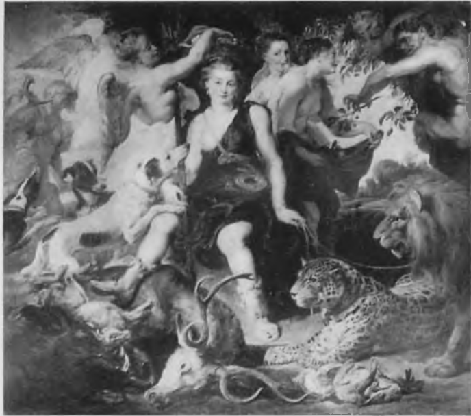
3. Rubens and F.Snyders, The Crowning of Diana . Potsdam-Sanssouci, Bildergalerie