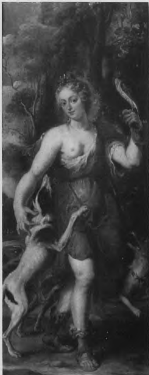
140. J.B.del Mazo after Rubens, Diana with a Falcon on her Wrist. Madrid, Prado