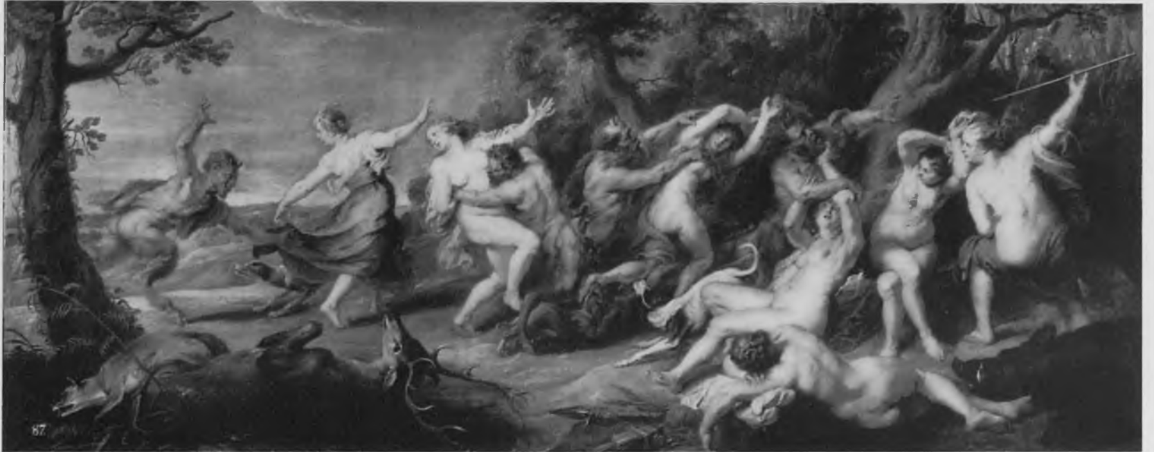
112. Rubens and F.Snyders, Diana and Nymphs attacked by Satyrs (No.22). Madrid, Prado