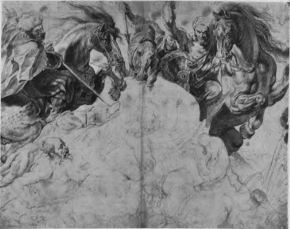
50. P. Soutman, Hippopotamus and Crocodile Hunt , drawing (No.5, copy 11), London, British Museum