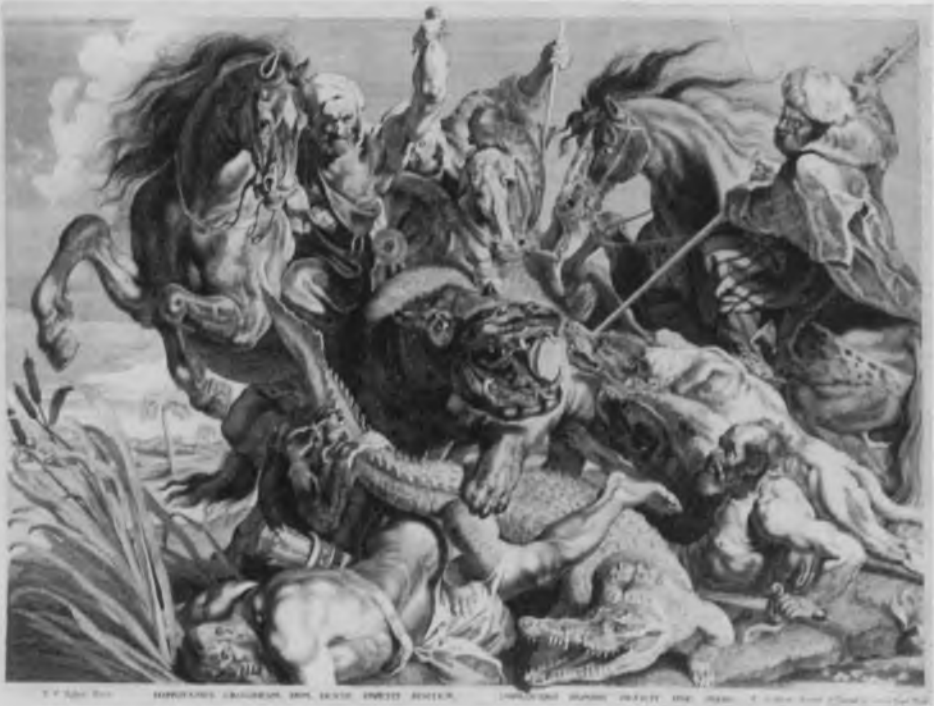
49. P. Soutman, Hippopotamus and Crocodile Hunt , etching (No.5, copy 14)