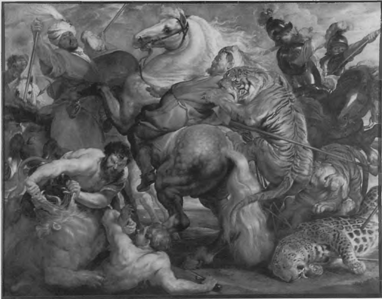
57. Rubens, Tiger, Lion and Leopard Hunt (No. 7) . Rennes, Musée des Beaux-Arts