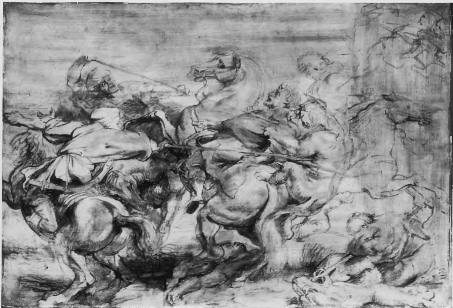
39. Rubens, Lion Hunt , oil sketch (No.3). London, National Gallery