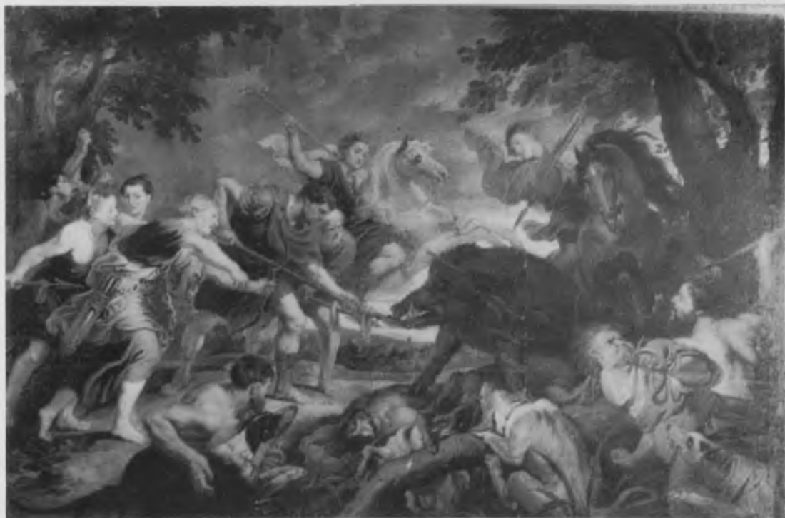
73. Studio of Rubens, The Calydonian Boar Hunt (No.10, copy 2). Patrimonio Nacional, Palacio de Riofrío