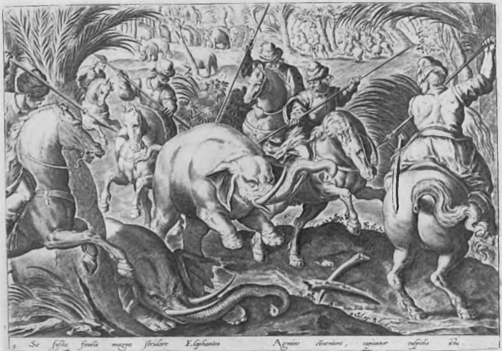
19. J.Galle after Stradanus, Elephant Hunt , engraving