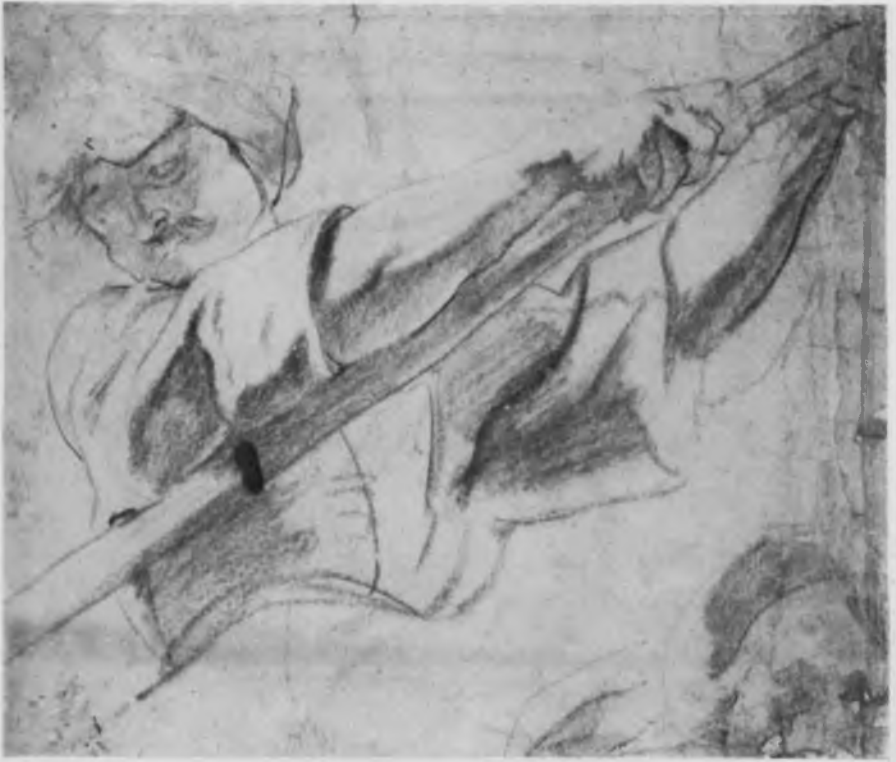
77. Rubens, Oriental Huntsman with Lance , drawing (No.11c). Berlin-Dahlem, Staatliche Museen, Kupferstichkabinett