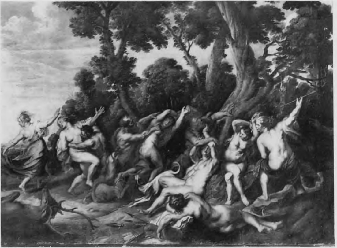
114. ?Studio of Rubens, Diana and Nymphs attacked by Satyrs (No.22, copy 2). Florence, Palazzo Pitti