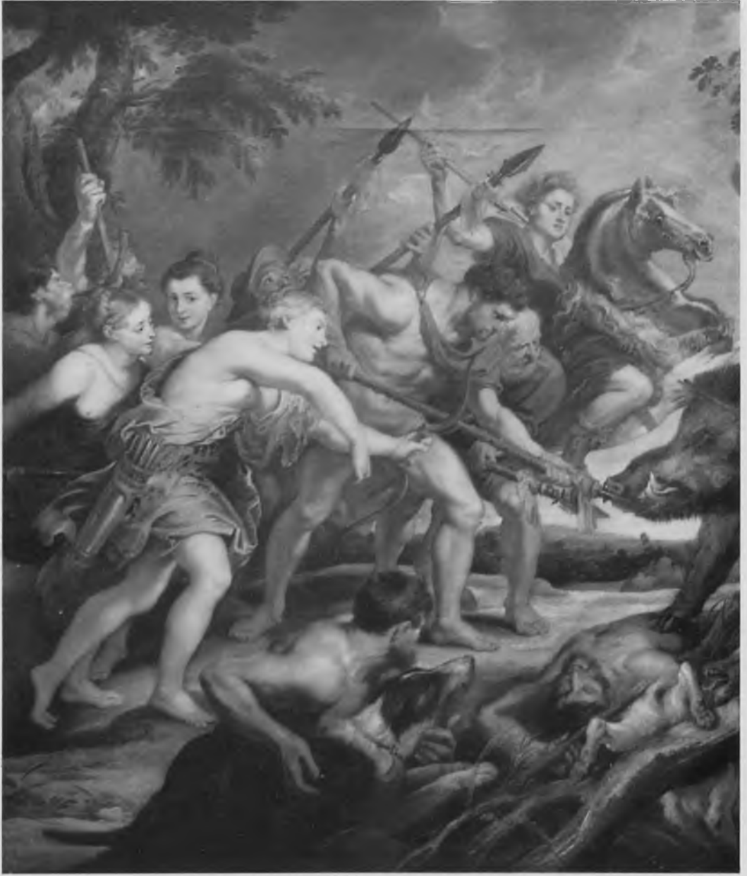
71. Detail of Fig.69