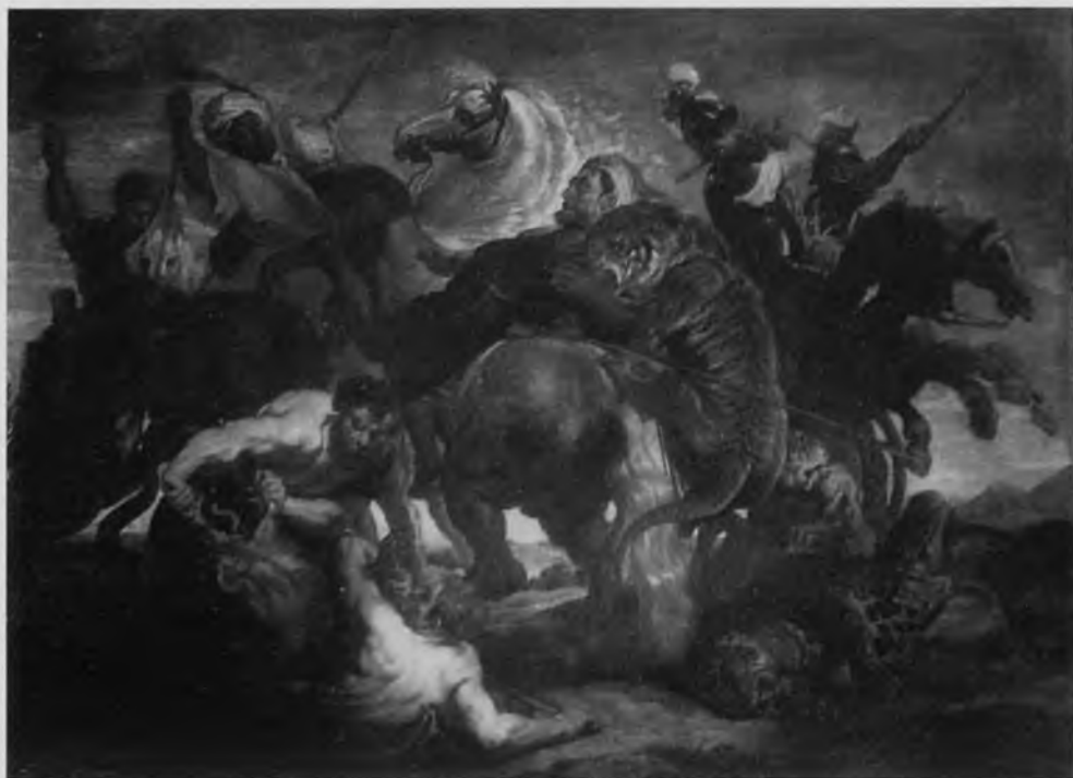
60. Studio of Rubens, Tiger, Lion and Leopard Hunt (No.7, copy 2). Present whereabouts unknown