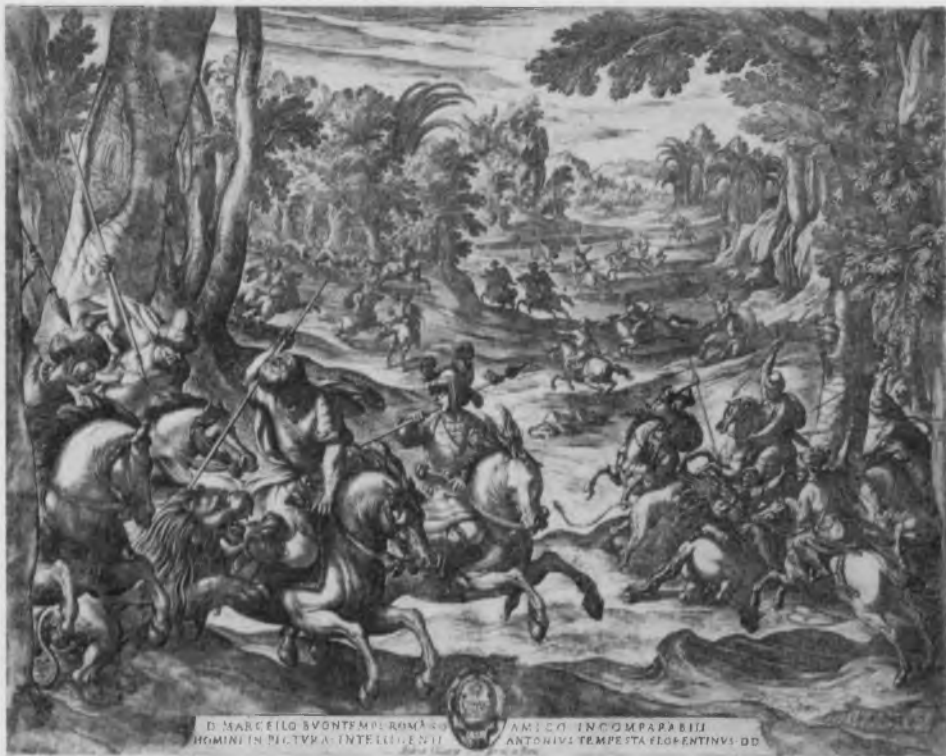
16. A. Tempesta, Lion Hunt , etching