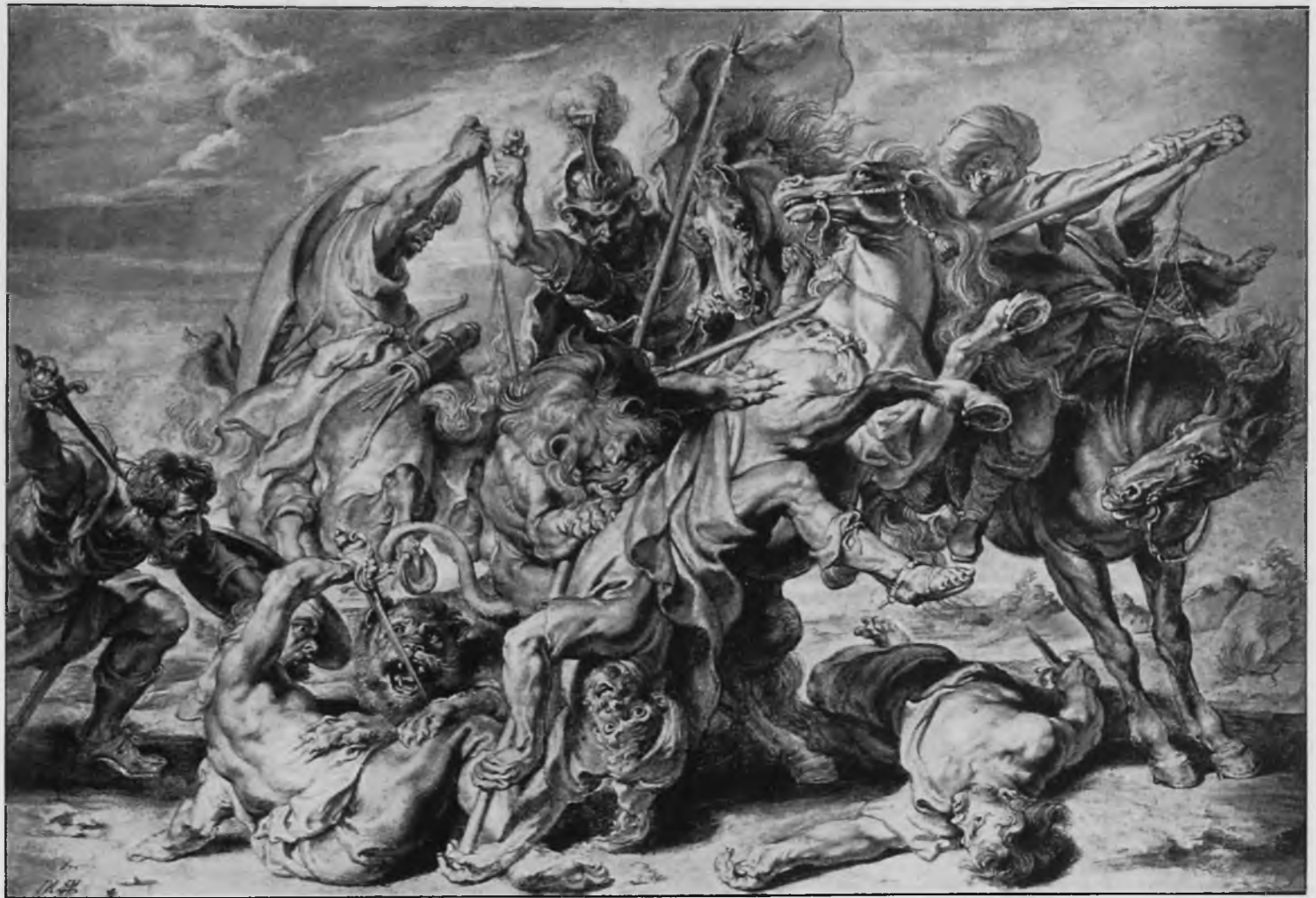
79. Retouched by Rubens, Lion Hunt , drawing (No. 111e). Paris, Cabinet des Dessins du Musée du Louvre