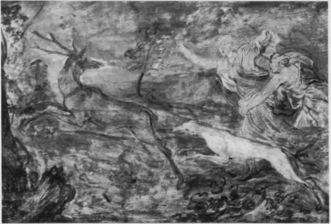
8. A. van Dyck, Nymphs hunting Deer , oil sketch. Rotterdam, Museum Boymans-van Beuningen