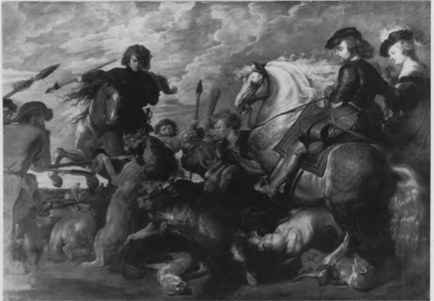
34. Retouched by Rubens, Wolf and Fox Hunt (No.2b). Corsham Court, Wiltshire, Coll. Lord Methuen