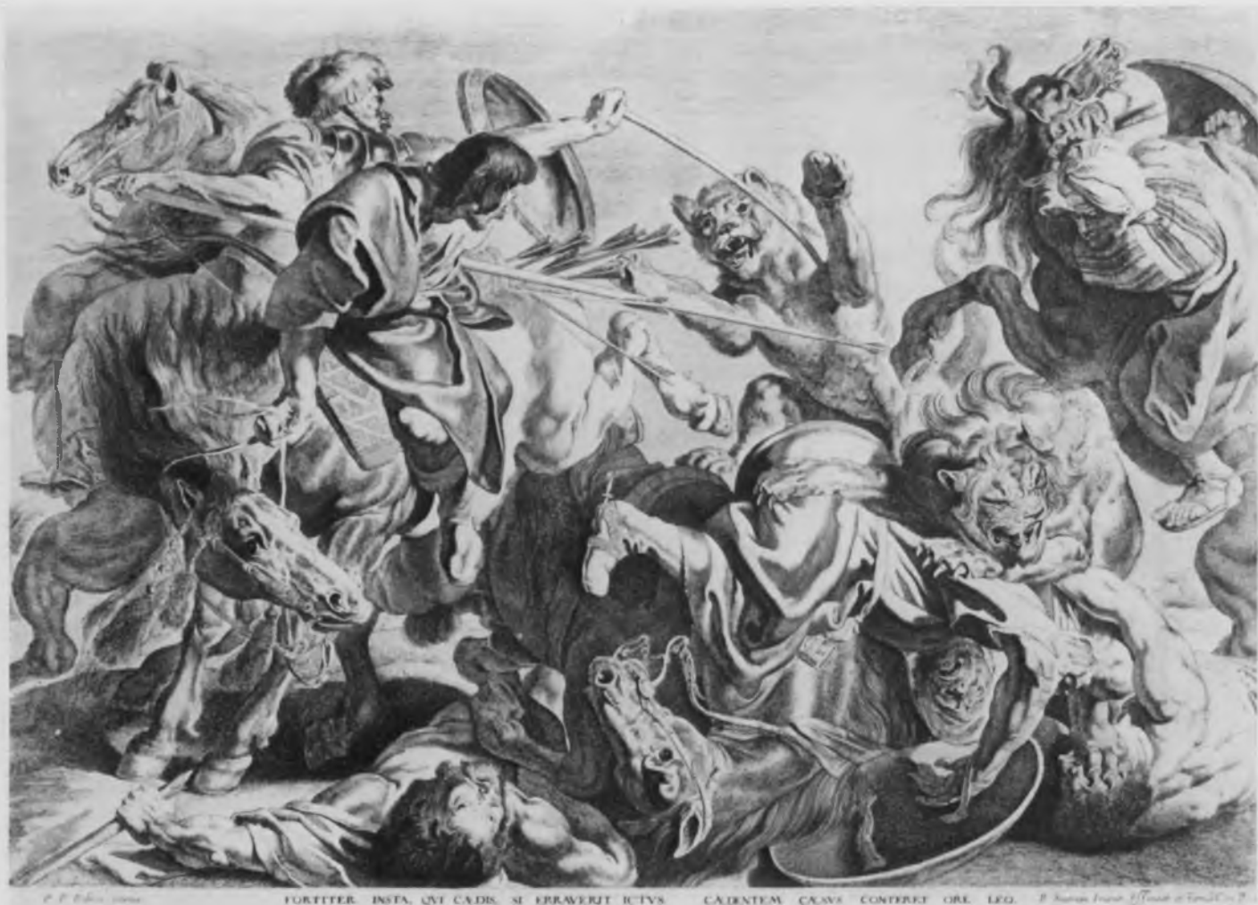
56. P. Soutman, Lion Hunt , etching (No.6, copy 9)