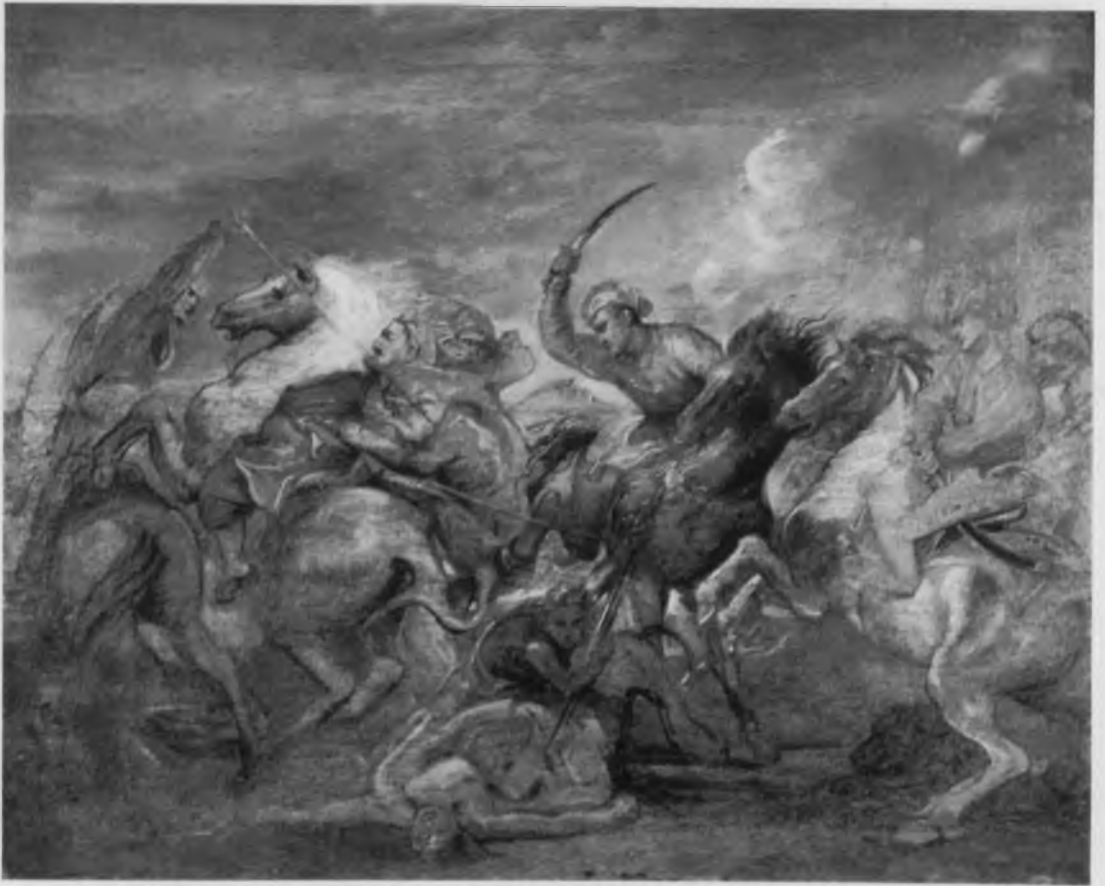
65. Rubens, Lion Hunt of the King of Persia , oil sketch (No.9). Worcester, Mass., Worcester Art Museum