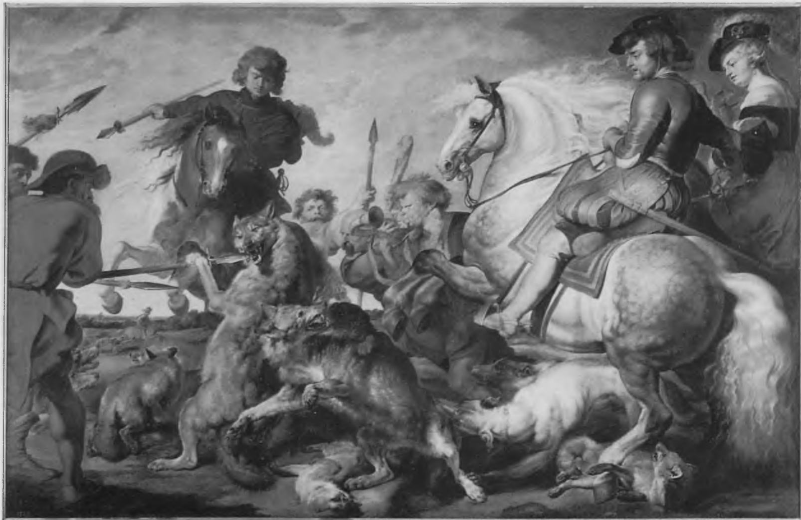
33. Rubens, Wolf and Fox Hunt (No.2) . New York, The Metropolitan Museum of Art