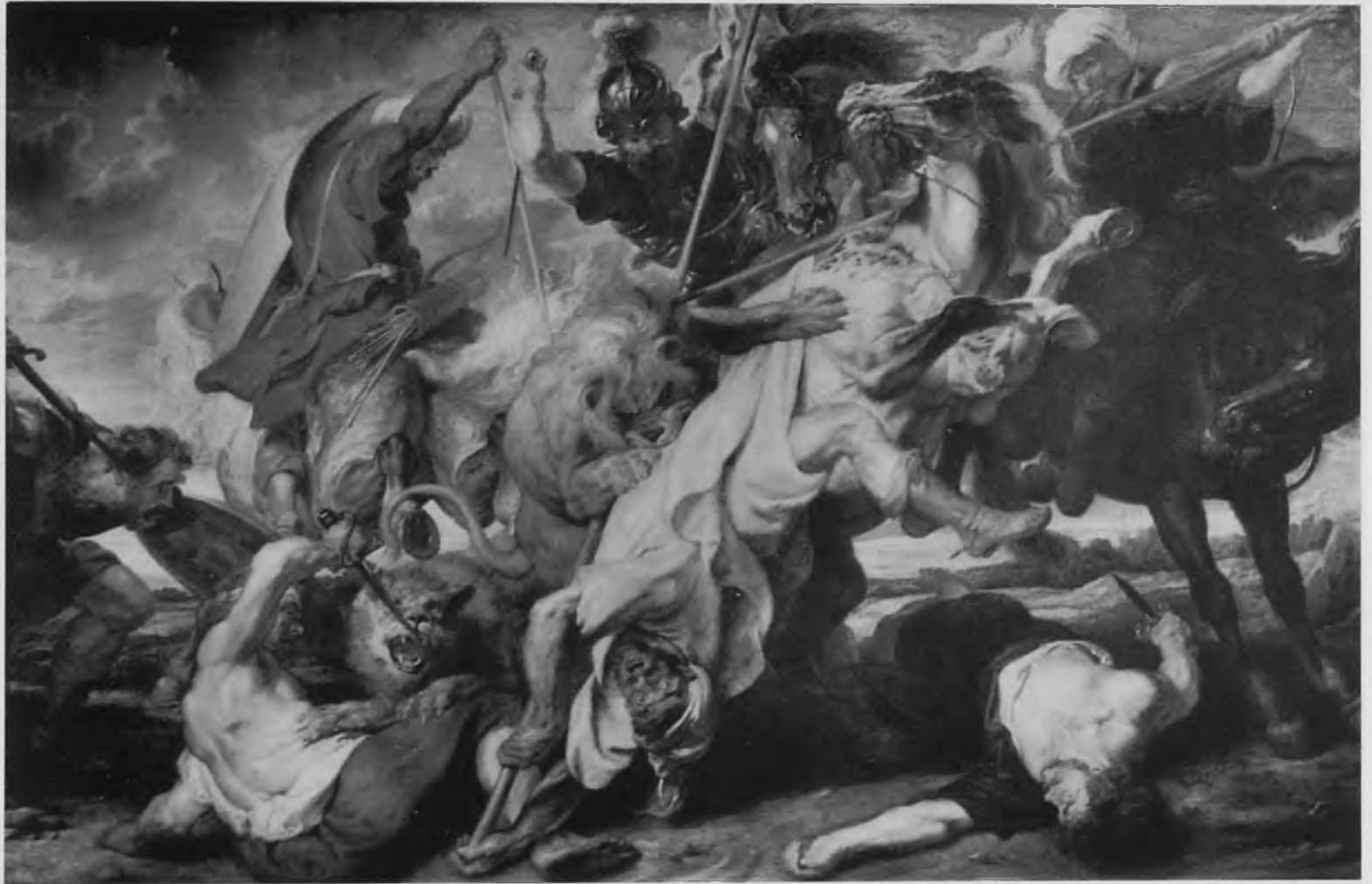
74. Rubens, Lion Hunt (No.11). Munich, Alte Pinakothek