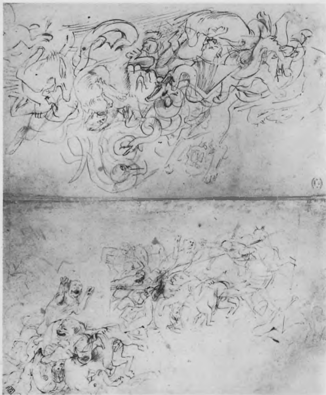
53. Rubens, Studies for a Lion Hunt and Wild Animals and Monsters , drawing (No.6a). London, British Museum