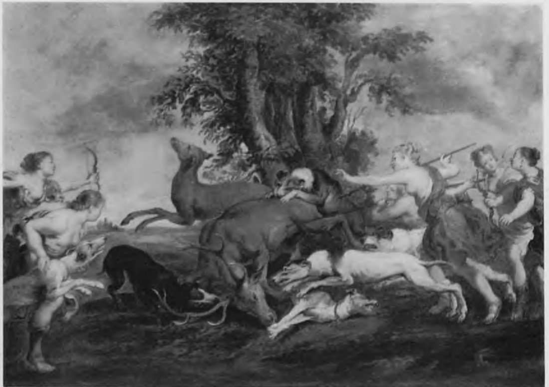
89. ?Rubens, Diana and Nymphs hunting Deer , oil sketch (No.13b). Switzerland, Private Collection