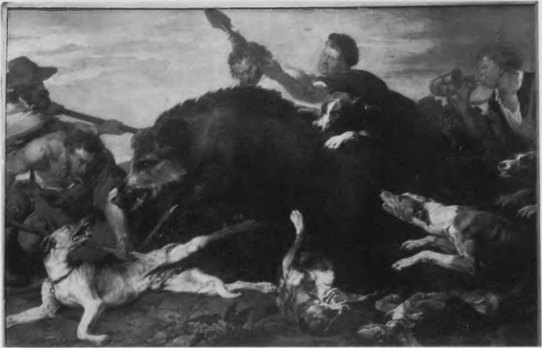
23. F. Snyders and A. van Dyck, Boar Hunt . Dresden, Gemäldegalerie