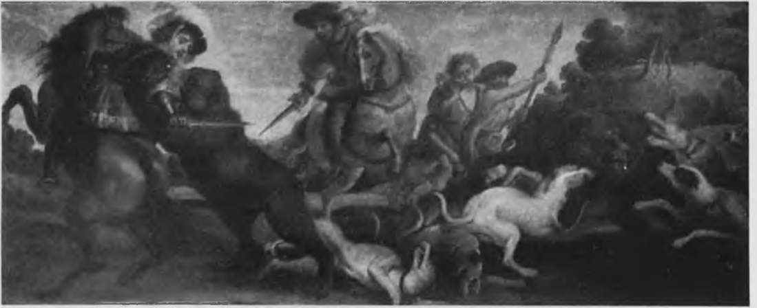
134. After Rubens and F.Snyders, Bear Hunt (No.27, copy 1). Nîmes, Musée des Beaux-Arts