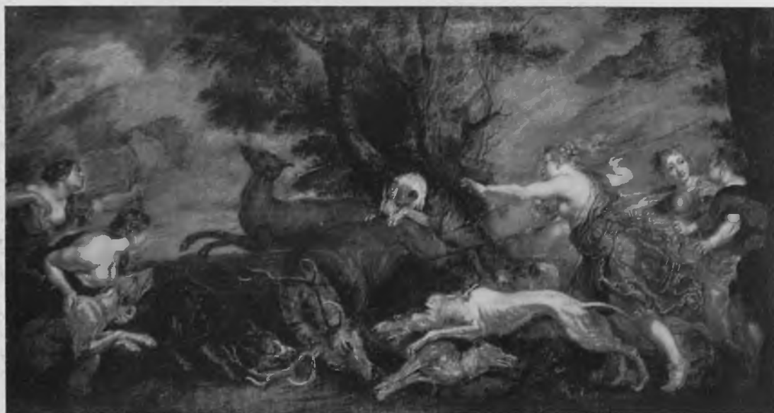
84. After Rubens, Diana and Nymphs hunting Deer (No.13, copy 4). Present whereabouts unknown