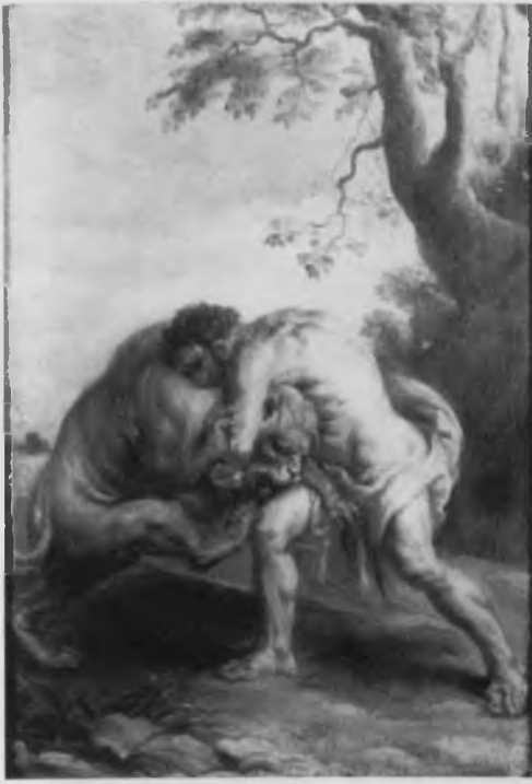
141. J.B.del Mazo after Rubens, Hercules strangling the Nemean Lion. London, Wellington Museum, Apsley House