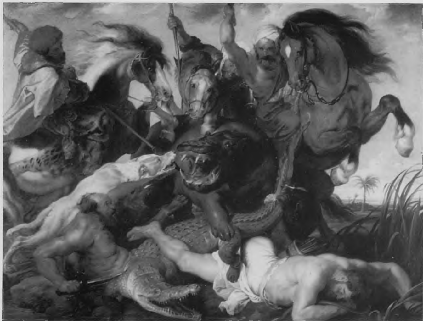
46. Rubens, Hippopotamus and Crocodile Hunt (No.5) . Munich, Alte Pinakothek