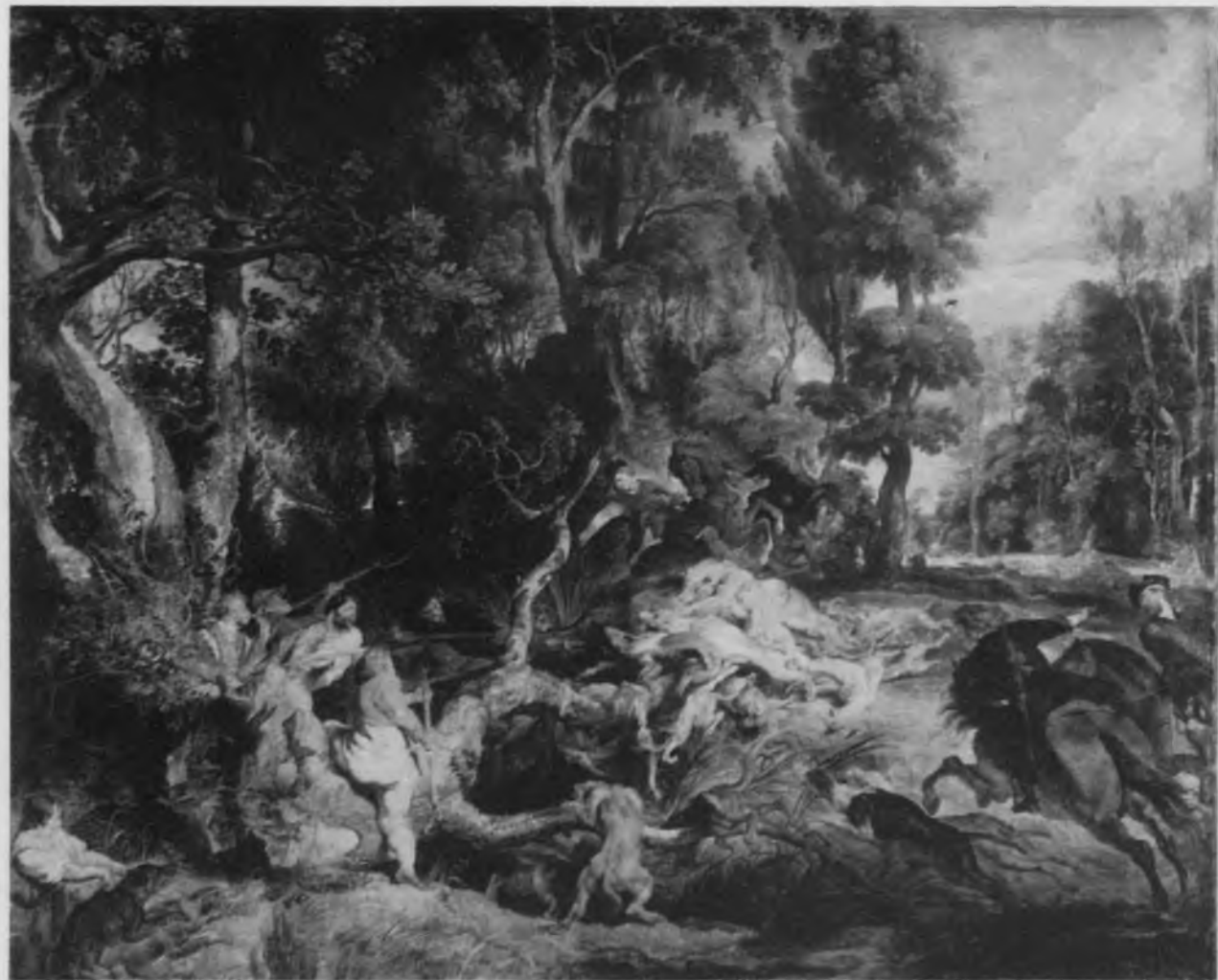
26. Rubens, Landscape with a Boar Hunt . Dresden, Gemäldegalerie