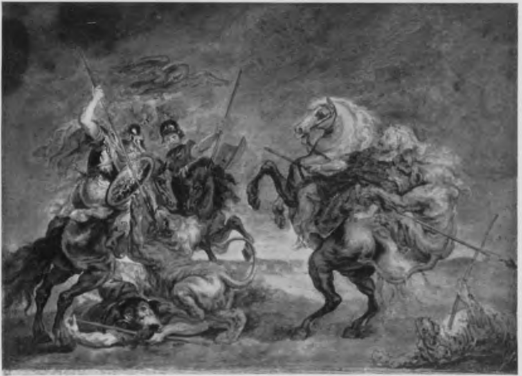
97. ?Rubens or after Rubens, Alexander's Lion Hunt , oil sketch (No.16b). Present whereabouts unknown