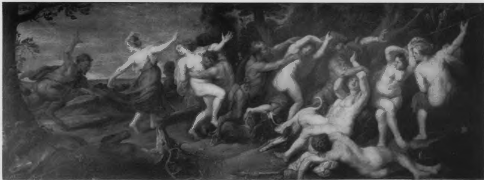
113. After Rubens and F. Snyders, Diana and Nymphs attacked by Satyrs (No.22, copy 1). Nîmes, Musée des Beaux-Arts