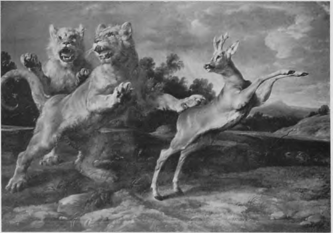
21. F. Snyders, Two Young Lions chasing a Roebuck . Munich, Alte Pinakothek