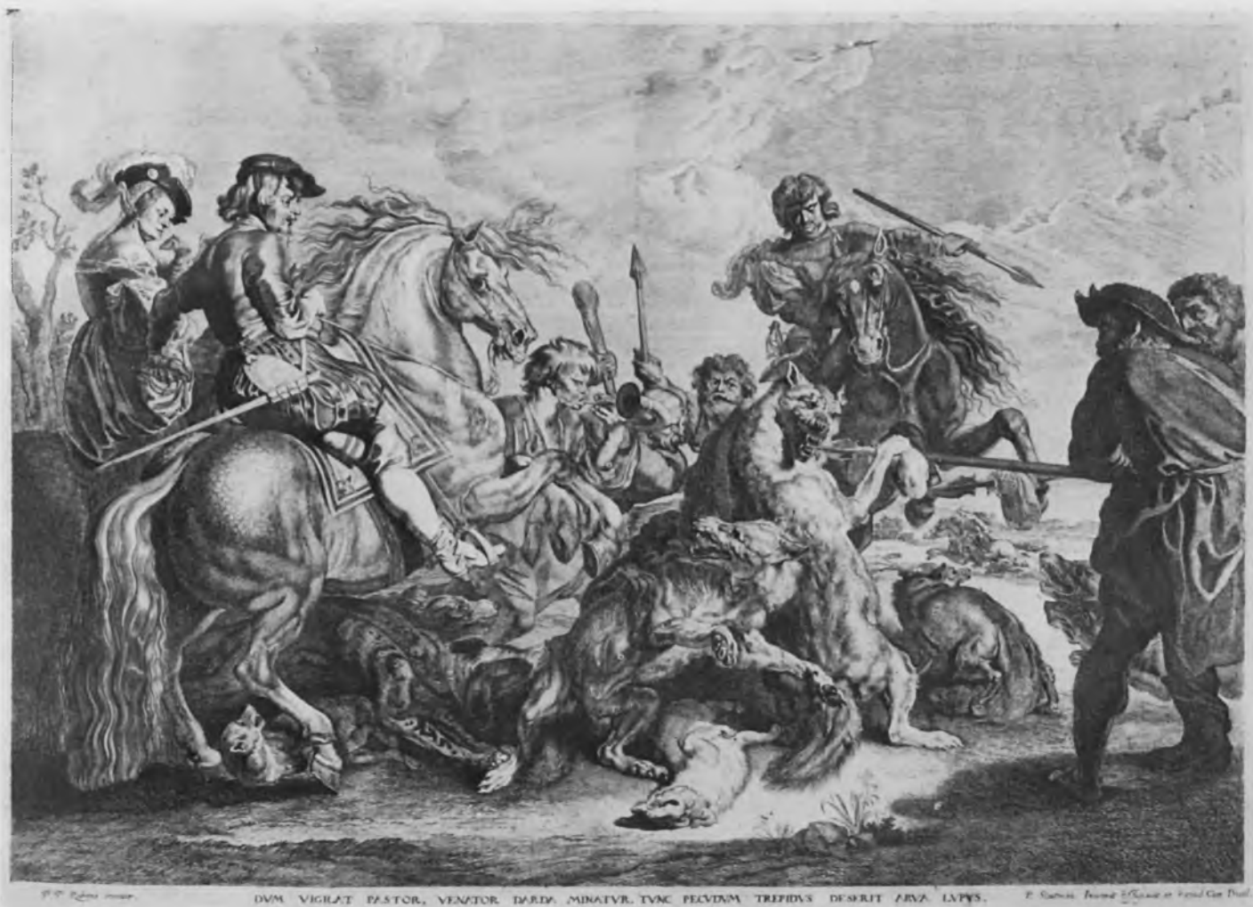
37. P. Soutman, Wolf and Fox Hunt , etching (No.2, copy 11)