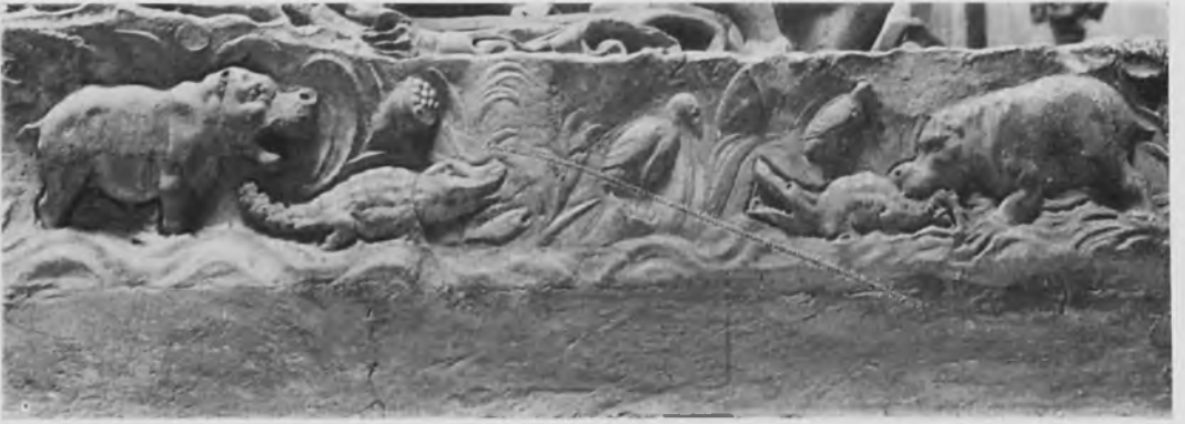
14. Hippopotamuses and Crocodiles , plinth frieze from statue of 'Nile'. Rome, Vatican Museum