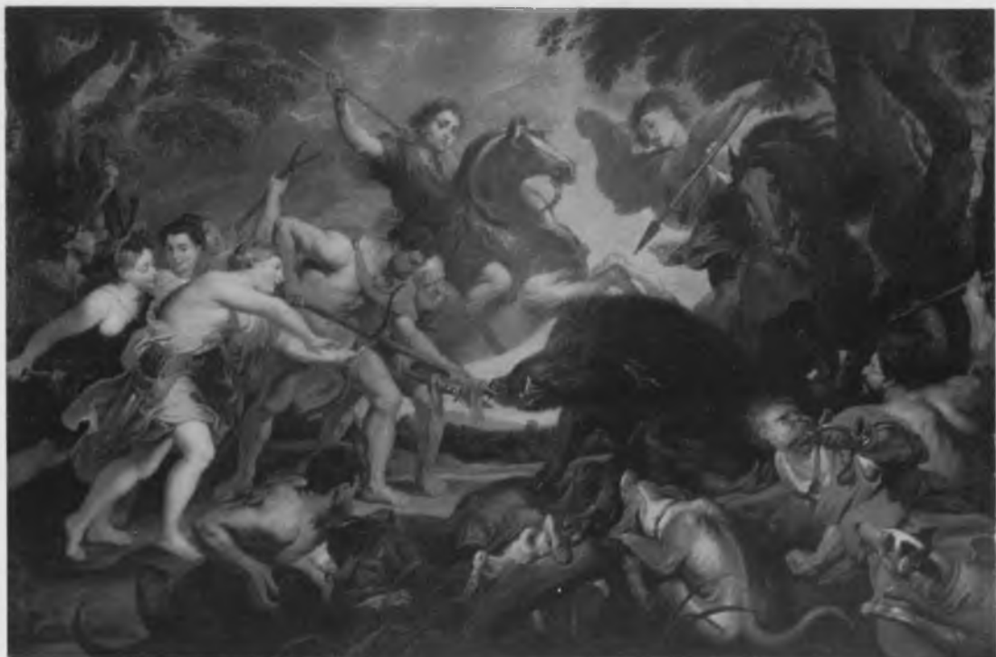
72. Studio of Rubens, The Calydonian Boar Hunt (No.10, copy 1). Present whereabouts unknown