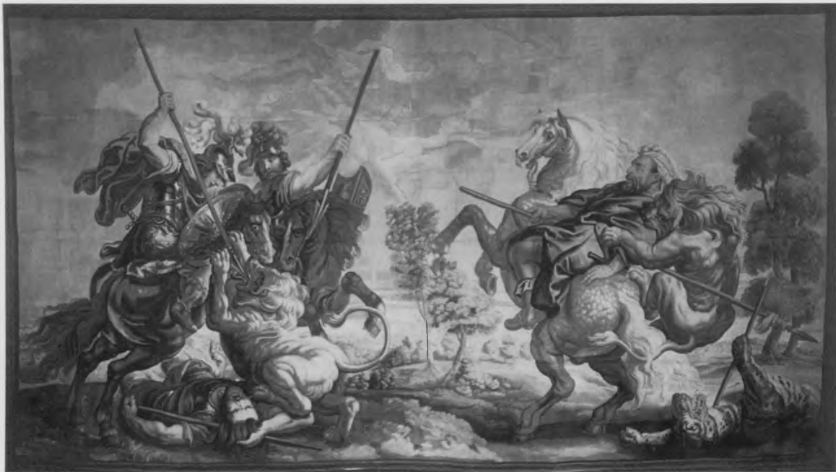
94. D. Eggermans (?the Younger), Alexander's Lion Hunt , tapestry (No. 16, copy 8). Present whereabouts unknown