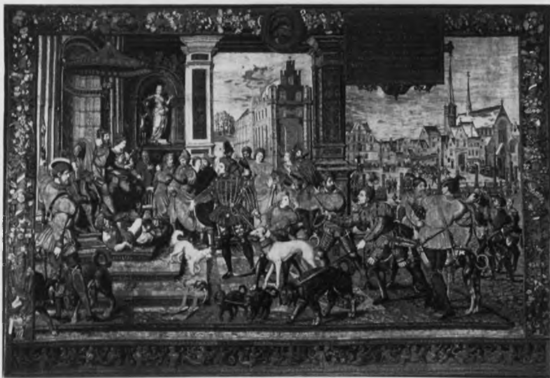
13. After B. van Orley, The Hunts of Maximilian: Homage to Modus and Ratio , tapestry. Paris, Musée du Louvre