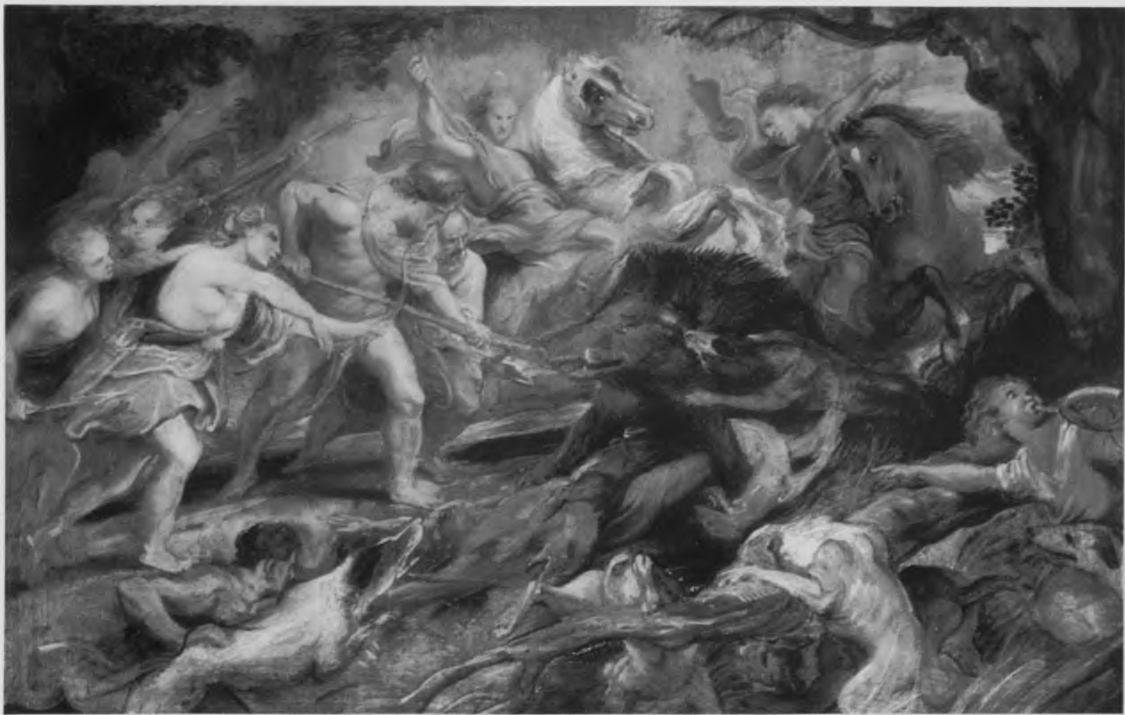
70. Rubens, The Calydonian Boar Hunt , oil sketch (No. 10a). Pasadena, California, Norton Simon Museum