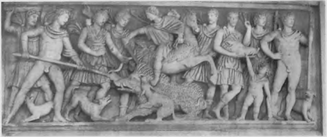
27. The Calydonian Boar Hunt , Roman sarcophagus. Woburn Abbey, Coll. Duke of Bedford