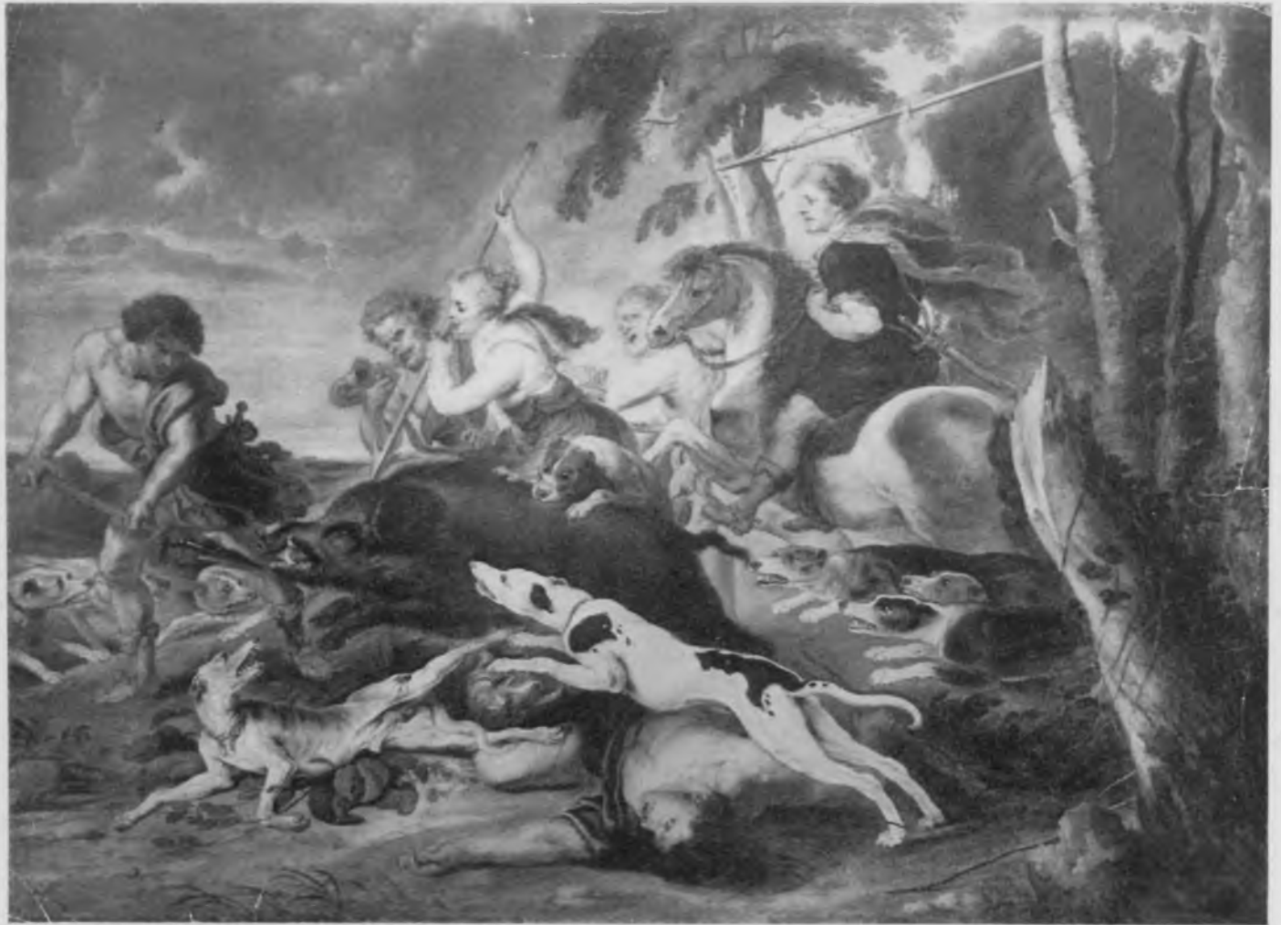
99. ?Studio of Rubens, The Calydonian Boar Hunt (No.18, copy 1). Present whereabouts unknown