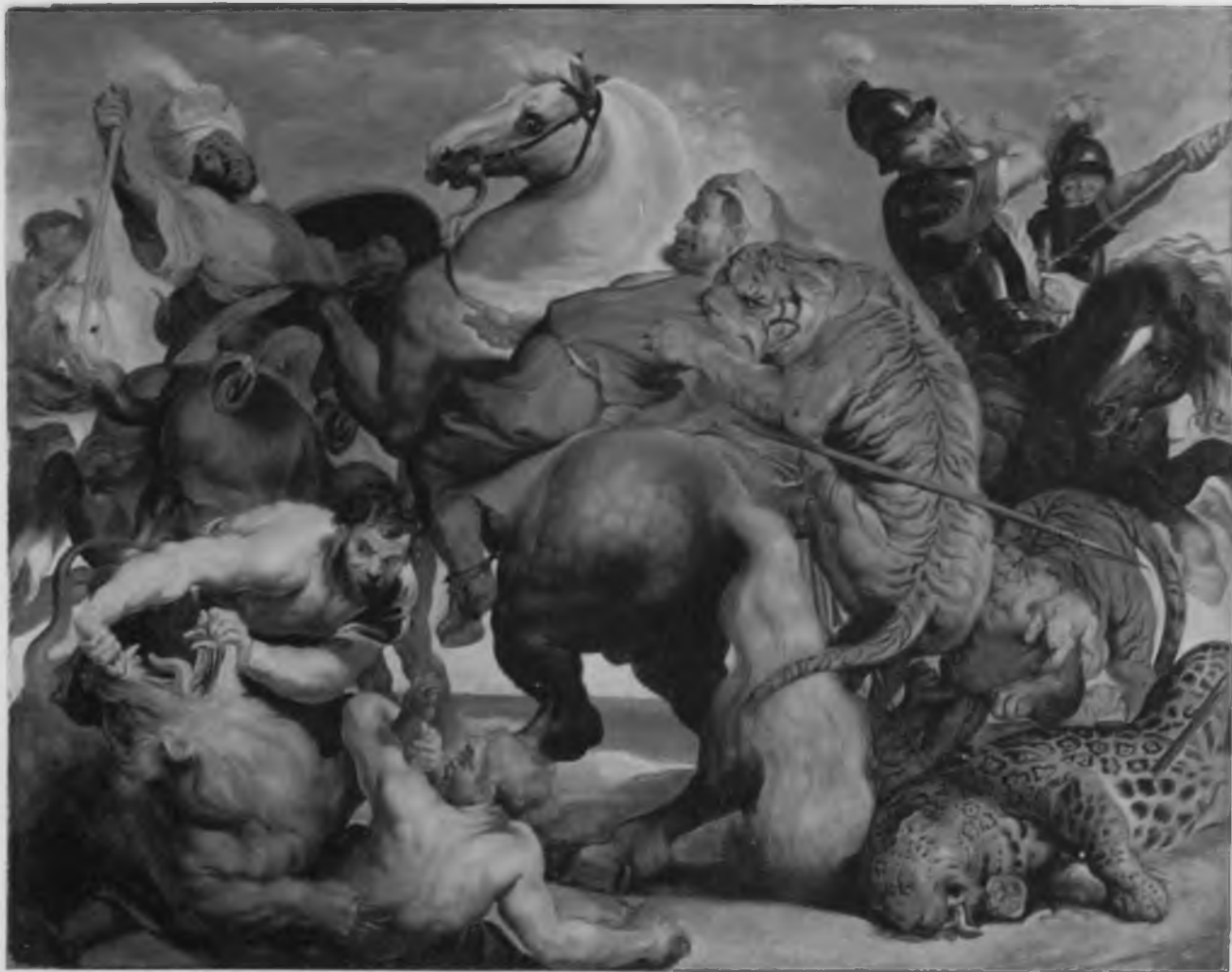
58. Rubens, Tiger, Lion and Leopard Hunt , modello (No.7a). Hartford, Conn., Wadsworth Atheneum, Sumner Collection