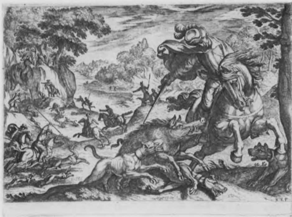
17. A. Tempesta, Boar Hunt , etching