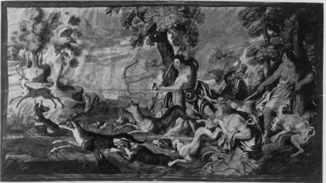
109. D.Eggermans (?the Younger), Diana and Nymphs hunting Fallow Deer , tapestry (No.21, copy 9). Present whereabouts unknown