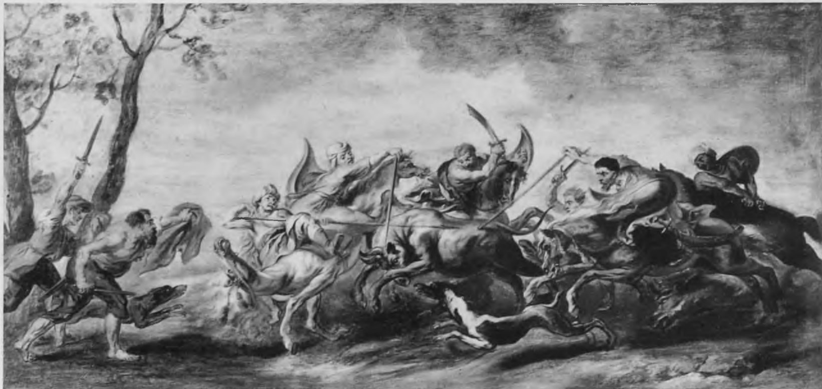
130. After Rubens and F. Snyders, Bull Hunt (No. 26, copy 2). Rome, Galleria Nazionale d'Arte Antica, Palazzo Corsini