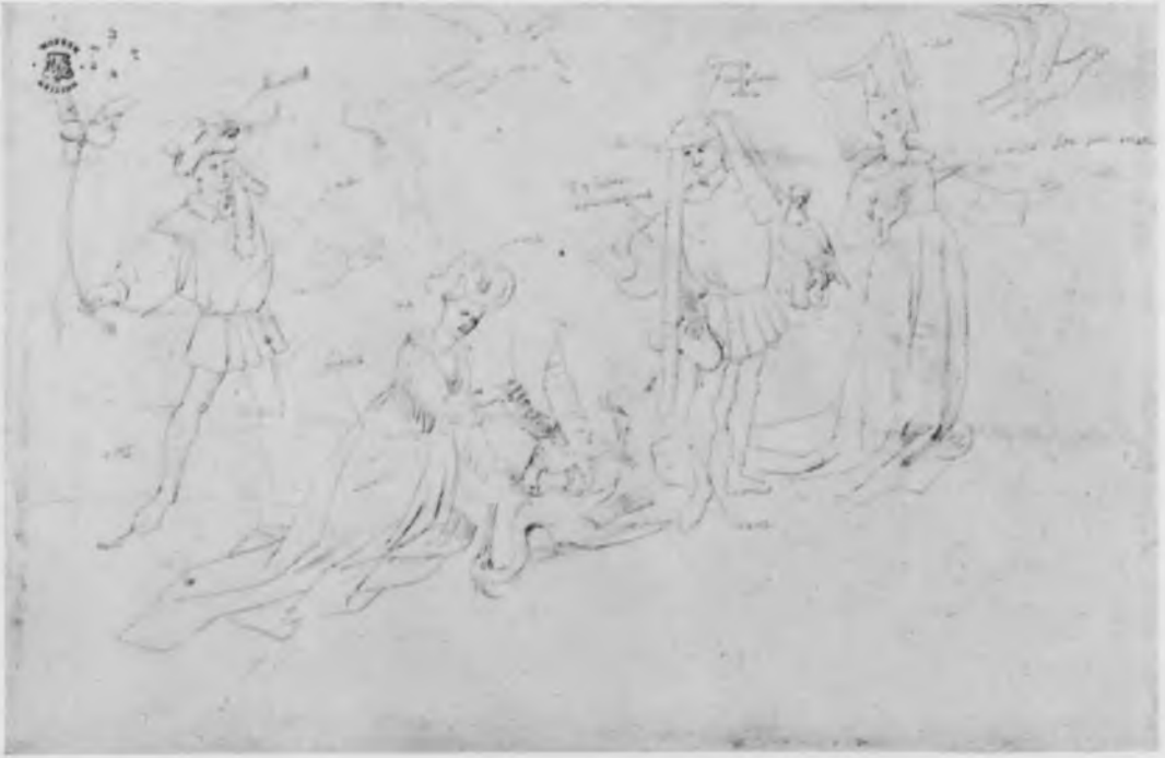
1. Rubens, Hunting Scene with Falcon , drawing. Costume Book , fol.14v. London, British Museum