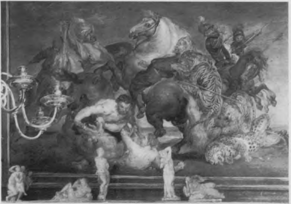
61. J. Brueghel, Allegory of Sight , detail (No.7, copy 1). Madrid, Prado