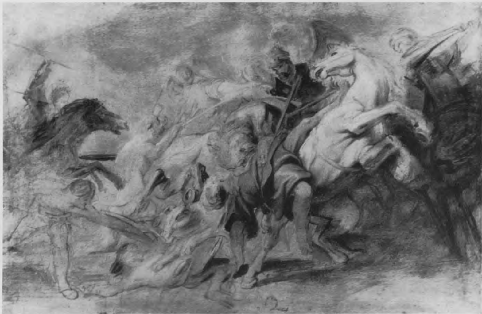
75. Rubens, Lion Hunt , oil sketch (No. 111a). Leningrad, Hermitage