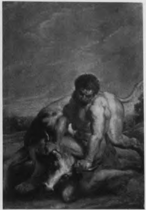
142. J.B.del Mazo after Rubens, Hercules and the Cretan Bull. London, Wellington Museum, Apsley House