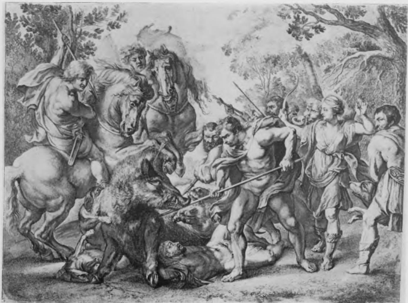
32. After Rubens, The Calydonian Boar Hunt , etching, retouched first state (No.1, copy 5). Paris, Bibliothèque Nationale