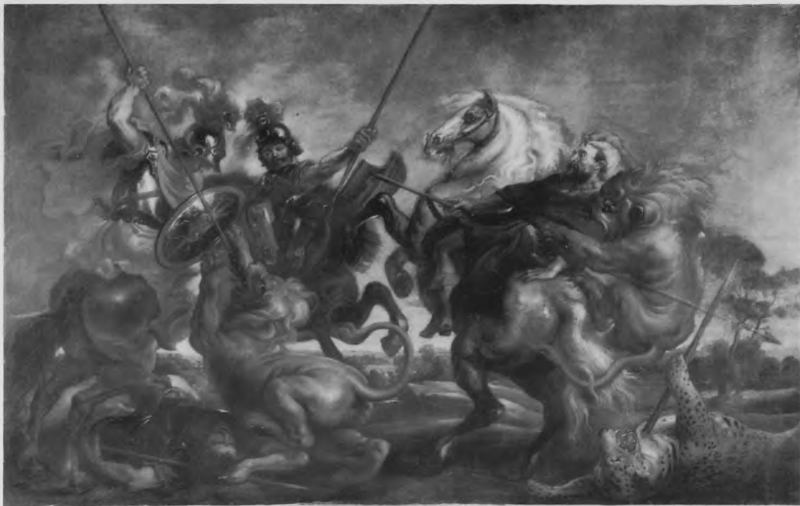
93. J.B. del Mazo after Rubens, Alexander's Lion Hunt (No.16, copy 1). Present whereabouts unknown